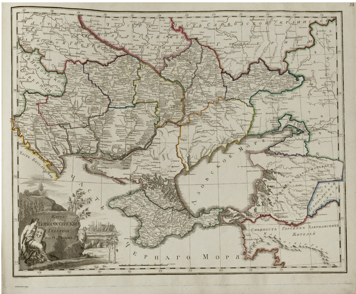
FIGURE 3 MAP OF THE GOVERNORATE OF NEW RUSSIA WITH ITS 12 DISTRICTS, 1800

Source: Rossiiskii atlas, iz soroka trekh kart sostoiashchii i na sorok odnu gubernii Imperii razdeliaushchii . Sostavitel A. M. Vilbrekht, St Petersburg, Geograficheskii departament Kabineta I. E.V., 1800. ( The Atlas of Russia composed of forty three maps dividing the Empire into forty one governorates )