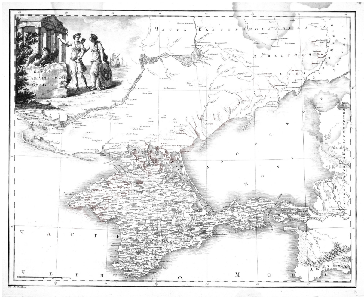
FIGURE 1 MAP OF THE TAURIDA REGION 1792