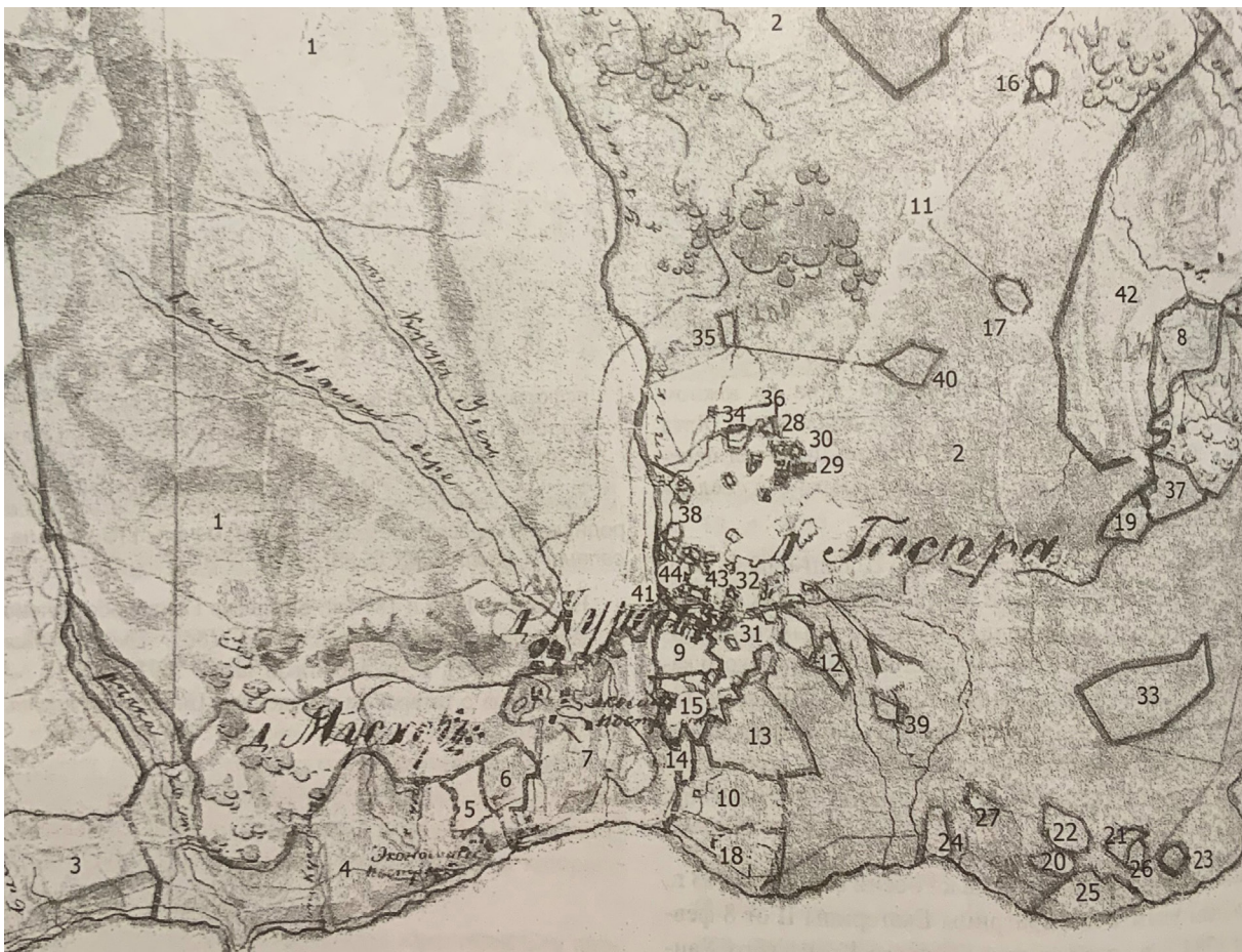
FIGURE 5 A FRAGMENT OF THE GENERAL SURVEY LAND PLAN OF THE YALTA DISTRICT

Dating to the 1830s, this plan shows the location of all land properties in the villages of Miskhor, Koreiz and Gaspra. In particular, the parcel numbers below refer to the lands occupied by the Tatar communities in Koreiz and Miskhor (1, 1656 dessiatins 347,5 square sazhen) and in Gaspra (2, 847 des. 895 sq. saz.); village Alupka (3, 1994 des. 190 sq. saz.) owned by Count M. S. Vorontsov and others as well as Vorontsov's other land parcels in Gaspra (20, 1 des. 1116 sq. saz. and 21, 2023 sq. saz.); land (4, 87 des. 2 192 sq. saz.) owned by Olga Naryshkina, the major's widow, in Miskhor; estate (6, 4 des. 1296 sq. saz.) of state councillor V. P. Zavadovskii; lands (7, 41 des. 590 sq. saz.) and (8, 11 des. 942 sq. saz.) owned by Princess A. S. Golitsyn; estates of Bunagi (13, 10 des. 323 sq. saz.) and Findi (18, 13 des. 2 115 sq. saz.) of colonel Prince S. I. Meshcherskii; Aianoga lands (28, 176 des.; 29, 70 des., and 30, 120 des.) owned by Mulla Ali, an official of the fourteenth rank of Tatar origin.