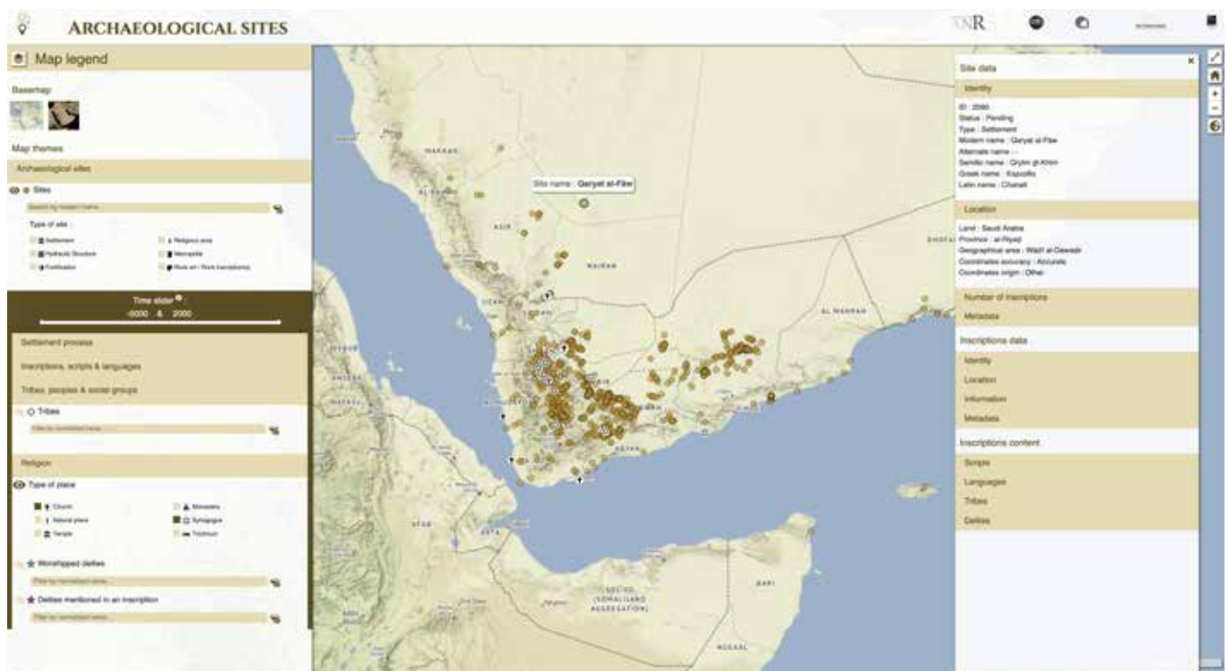
Fig 1. Screenshot of the online digital atlas interface (Maparabia project/CNRS/CNR/Cartodia).

It is a 5-year project funded by the French National Research Agency (ANR-18-CE27-0015, PI J. Schiettecatte), 2019-23, which encompasses a variety of fields of research: history, archaeology, epigraphy, linguistics, palaeography, geomatics, and geography. The fifteen members of the project come from four laboratories dedicated to pre-Islamic Arabia: CNRS-Orient & Méditerranée (Paris), CNRS-Archéorient (Lyon), Dipartimento di Civiltà e Forme del Sapere of the University of Pisa, and CNR-ISPC (Milan).