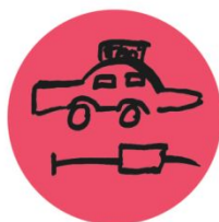
Car pooling service for addicts