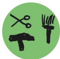
Self-renovation of old homes for occupation

1 2 3 4 5 6 7 8 9 10 11 12 13 14 15 16 17 18 19 20 21 22 23 24 25 26 27 28 29 30 31 32 33 34 35 36 37 38 39 40 41 42 43 44 45 46 47 48 49 50 51 52 53 54 55 56 57 58 59 60 "I must get more insight into the world of normal, working people who think differently from me, in order to be able to understand them better and give these people more insight into my world, into my situation, so that they can become more understanding toward me." (Man, Hanover)