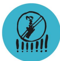
No sexual blackmail by security services