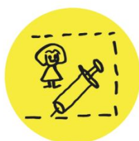
DCR for women only