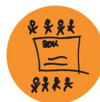
Universal health insurance