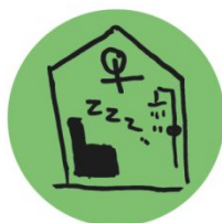
Resting place for women only