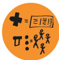
Substitution for everyone