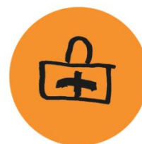
Better medical care with drug awareness