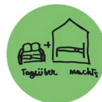
Shelters open during the day