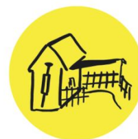
24/7 DCRs with front yard across the city

The colors refer to the five issues of the ICW: drug consumption (yellow), housing (green), transport (pink), safety (blue), health (orange)