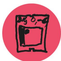
Free public transportation