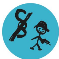
Decriminalisation of drug use