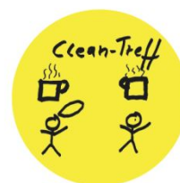
Meeting place for people on substitution therapy