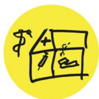
Legalized drugs in pharmacies