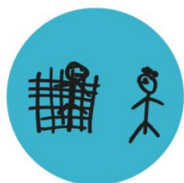
Social services instead of imprisonment