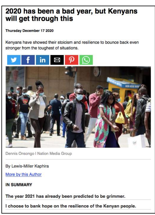
"2020 has been a bad year, but Kenyans will get through this."

The resilience narrative was also cast as the ability to transform hardships into opportunities, as Kenyatta said himself in his 2021 New Year Message: "in the moment of adversity lay also the seeds of opportunity." Opening a conference with governors dedicated to "building resilience to deal with future pandemics," Kenyatta announced, in August 2020, that an analysis of the current crisis "should guide us on how to use the lessons learned from the COVID-19 experience in order to anchor the full national roll-out of the Universal Health Coverage." The Minister of Health tried to translate what such adaptability would mean in Kenyans daily lives. On July 28, while announcing a ban on alcohol-sale in bars and restaurants, he defined what he called a "new normal" as "sausage mbili, soda moja" in Swahili (two sausages, one soda), a new lifestyle that would supposedly limit the risks of contamination.