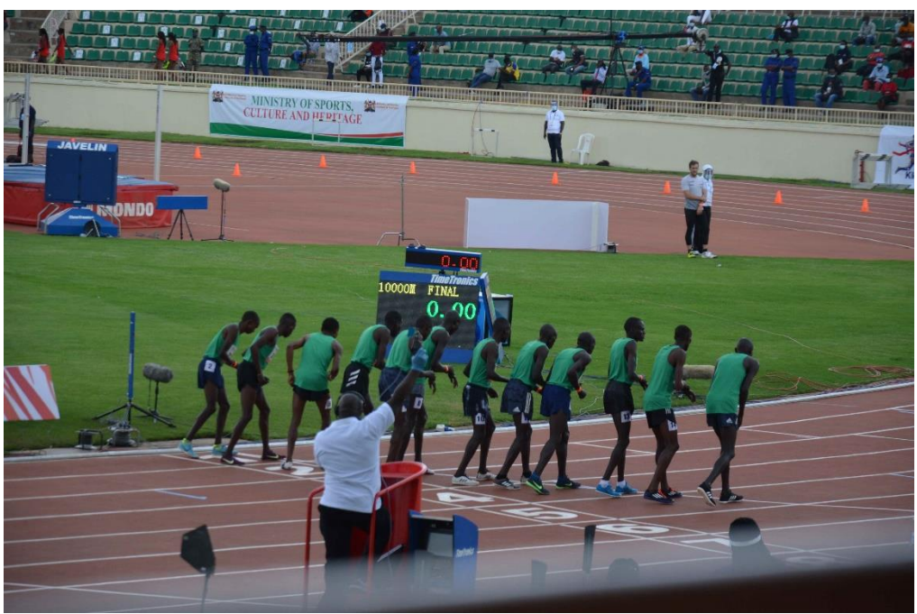
Kenyan runners getting ready for a national competition in Nyayo Stadium, Nairobi, on October 3, 2020.

In sum, the resilience narrative was not only well-planned through a carefully thoughtout media strategy, but it also relied on identifiable heroes and heroines who could embody endurance and creativity.