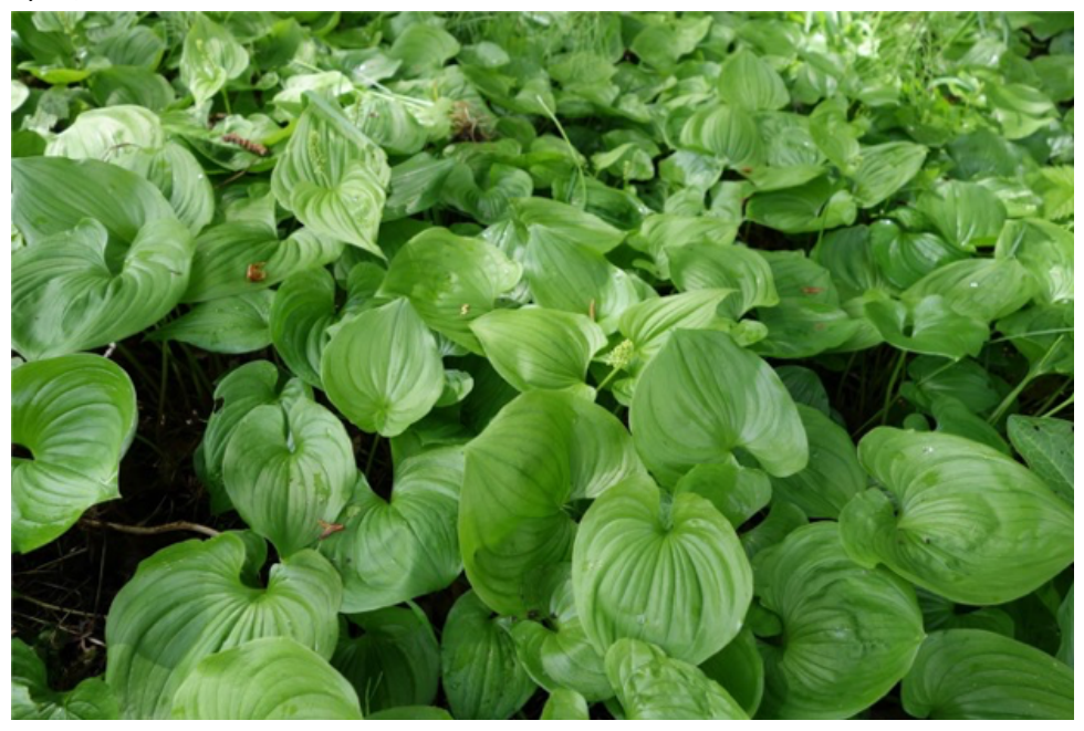
Figure 2. Wild lily of the valley tamdza'nu 'belongs to the frogs'.

Many plant names are derived forms. For example, tams -, the root word from which tamdza'nu is derived, is a verb which means 'to pick the fruit of the wild lily of the valley', combined with a nominalizing suffix -a'nu meaning 'plant'. Some plant names are more complex and demonstrate descriptive combinations of morphemes, such as kakamxwala'mas 'eagle down plant' known in English as 'cottongrass' (cf. kamxwa 'eagle down') (Turner & Bell 1973:272; Turner 2014:129). We