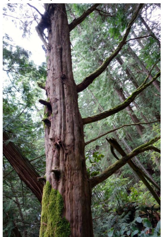
Figure 4. Pacific yew, tlamka 'yew wood or tree'.

for 'sledgehammer', tlamgayu (also used to mean 'wedge' Boas 1948:425; FirstVoices 2018).