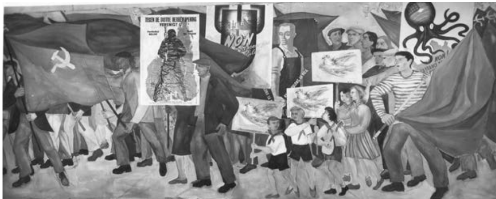
Figure 1.1., 1.2., and 1.3.

Forces Murales and Métiers du Mur, La marche au socialisme , 1951, triptych, each 230x600 cm.