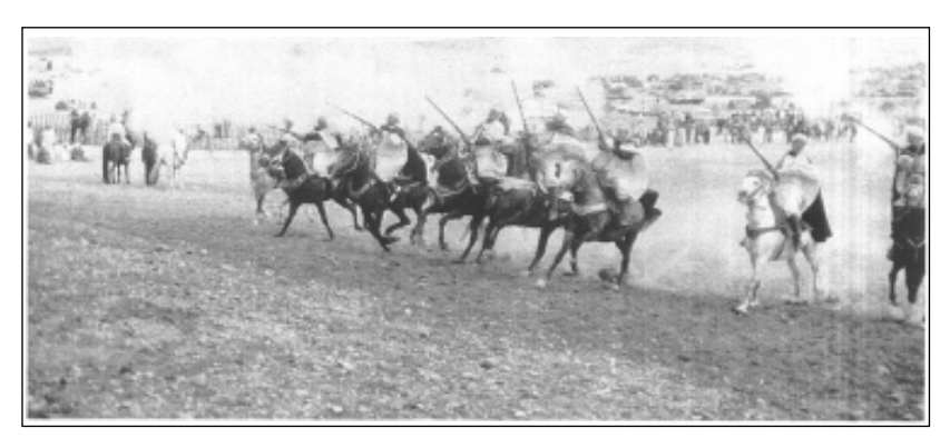
Fig. 2. Fantasia, Asla.

Cane fighting is a leisure well appreciated during the festival. The fighter's equipment is really light: usual clothes and a wooden cane. Fights are non violent. The aim of this game is to show dexterity by touching the sparring partner with the cane. It is a revival of Bedouin fights which formerly took place with Arab swords. But this game is less appreciated than the fantasia, the competition of the Bedouin cavalries (picture 2). Without contest, fantasia is the main playful celebration during the festival. It attracts numerous people. The fantasia of the Sid Ahmad Majdûb's festival is the most impressive one. Several cavalries come from the entire west Algeria in order to participate in it. The fursan (horse riders) are organized by fraction (of tribe) or by village. They all compete during the festival. Thus cavalry's competitions are also, in some manners, inter-fraction, intertribal or inter-village competitions. The cavalries of the Awlâd Nhar-a tribe located south of Tlemcen (north of Asla)-are considered the most impressive ones. Fantasia is a competition between tribes or villages but it symbolizes also the resistance's history of the region. As it was said, numerous insurrections occurred in