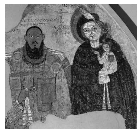
Fig. 8: Nubia, Cathedral of Faras, the National Museum of Warsaw, Bishop Marianos with the Virgin holding the Child (R. Y. Nasr)

While the handkerchief may bear a liturgical meaning in some examples, this would give the image of the Theotokos a Eucharistic or connotation. However, sacerdotal this reading cannot be automatically applied to all the images of the Madonna with a handkerchief; such a hypothesis must be based on compelling iconographic and syntactic indicators. When Virgin carries the Child directly on the handkerchief, when her image is represented with one or more themes referring to the Eucharist, and when the whole is anchored in the liturgical space, only then can a liturgical reading of the image