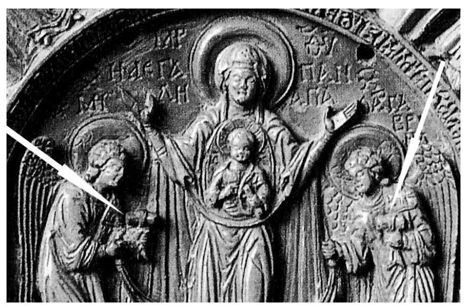
Fig. 7: Mount Athos, Monastery of Xeropotamou, ivory paten

One of the most remarkable and striking examples of the liturgical meaning attached to Mary's handkerchief can be seen in a painting in the Cathedral of Faras (1003–1036) in Nubia, held at the National Museum of Warsaw (Thomas 1997: 368-370). The Virgin, carrying the Child in her left hand, stands facing forward, alongside Bishop Marianos holding a book with his left hand (Fig. 8). Mary and the prelate are holding a similar form of the maniple in the same way, hanging from the finger of their right hands. The Virgin carries her Child directly on this maniple. The iconographic feature that brings together the bishop and the Mother of God in Faras could reflect the common nature of Mary's priesthood and that of the prelate (Lidov 2009: 249). Moreover, by carrying the Child directly on the maniple, the Virgin makes a meaningful reference to the Host held by priests using a similar piece of cloth, that is, the way Christ the priest distributes Communion to the Apostles. Thus, the Theotokos of Faras is depicted in a manner reminiscent of a priest holding the Host of the Mass.