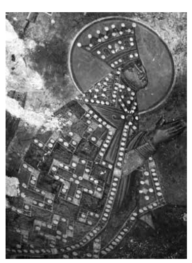
Fig. 5: Treskaveč, the Virgin Monastery, the cupola painting, the procession of the Littl Entrance, the Virgin as bishop