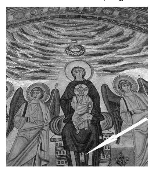
Fig. 1: Poreč, Euphrasian Basilica, the mosaic of the apsidal conch, the Virgin and Child (V. Sarabianov)

A significant example can be seen in the apsidal conch of the Euphrasian Basilica in Poreč, where the garments of the Virgin with Child enthroned in the center of the composition stand out, as she is dressed in a white stole with a cross (6<sup>th</sup> century, Fig. 1) (Prelog1986). This stole, which appears under the mantle of the Theotokos and goes down to her feet, is similar to those worn by priests. If we consider this a sacerdotal stole, we can assume that the intent was to compare the Virgin to a priest of the Early Christian era. However, this hypothesis is uncertain (Terry and H. Maguire 2007: 103–104; Heilbronner 2007-2008: 41; Angheben 2012: 68).