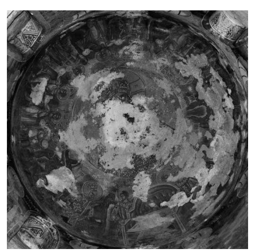
Fig. 4: Treskaveč, Monastery of the Virgin, the painting on the cupola, the procession of the Little Entrance

I suggest that this theme refers not the "royal court" or the "royal deisis" but to the procession of the Little Entrance. At this stage of the mass, the bishop's solemn entry takes place as he comes to occupy his cathedra, as does the transfer of the Gospel to the main altar, often with the cross and the liturgical instruments that bring the Passion of Christ to mind.