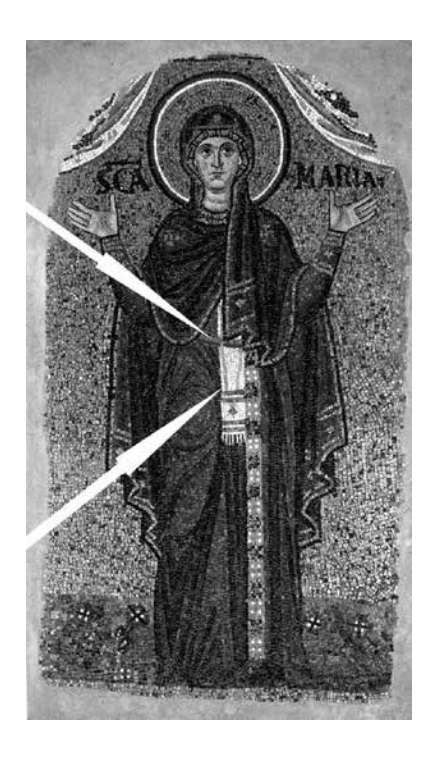
Fig. 2: Ravenna, Cathedral, mosaic of the apsidal arch, the Virgin with an orant gesture (R. Y. Nasr)

attributes to those of a priest (Fig. 2) (Кондаков 1915: 77-78, 378-380). Two elements decorate the garments of the Mother of God. They are similar to an epitrachelion (ἐπιτραχήλιον), a type of stole, without which no celebration can be held, and a zone (zώνη), a belt to hold the epitrachelion (Brightman 1908: 261-263; Bornert 1966: 79, 251-253; Bernardakis 1902: 129-139; Thierry 1966: 308-315; Innemée 1992; Woodfin 2012). The resemblance between these items of clothing and the liturgical attributes of priests would give the image of Mary a priestly dimension. In addition, the figure of the Virgin of Ravenna, in an orant position, similar to an officiant. may support this hypothesis (Lidov 2009; Nasr 2018 and 2020).