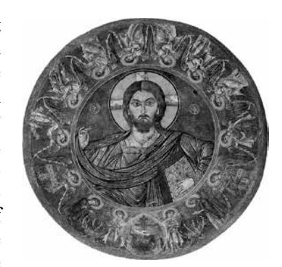
Fig. 6: Lysi, Church of Panaghia, the cupola painting, the procession of the Little Entrance (V. Sarabianov)

During this procession, the celebrant recites the Trisagion prayer, which offers a glorious image of Christ interceded by the Virgin and saints, "praised by the Seraphim with Thrice-Holy Voice", "glorified by the cherubim and adored by all celestial powers" (Mercenier and François Paris 1937: 236; Salaville 1942: 75-76). This Trisagion is directly related to the rite of the Blessing of the Throne, in which the celebrant invokes the One seated on the throne of the cherubim (Mercenier and François Paris 1937: 237; Salaville 1942: 77-78). In this particular case, liturgists see a symbolic representation of the throne