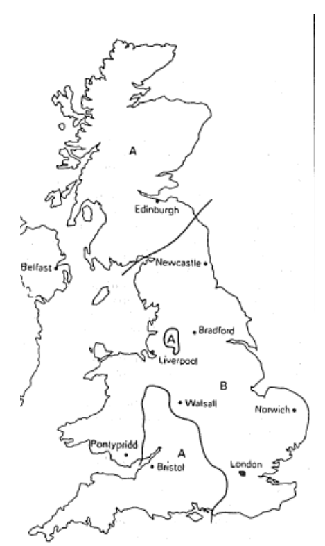
Illustration 1: Post-vocalic -r in English dialects. A: presence; B: absence.

Illustration 1 shows post-vocalic -r (in e.g. car , birth etc.) preserved in three relic areas—the southwest, Scotland and a region close to Liverpool; while r-less pronunciations have spread from the southeast to occupy a continuous zone in the centre, up to Scotland in the north, and in Wales.