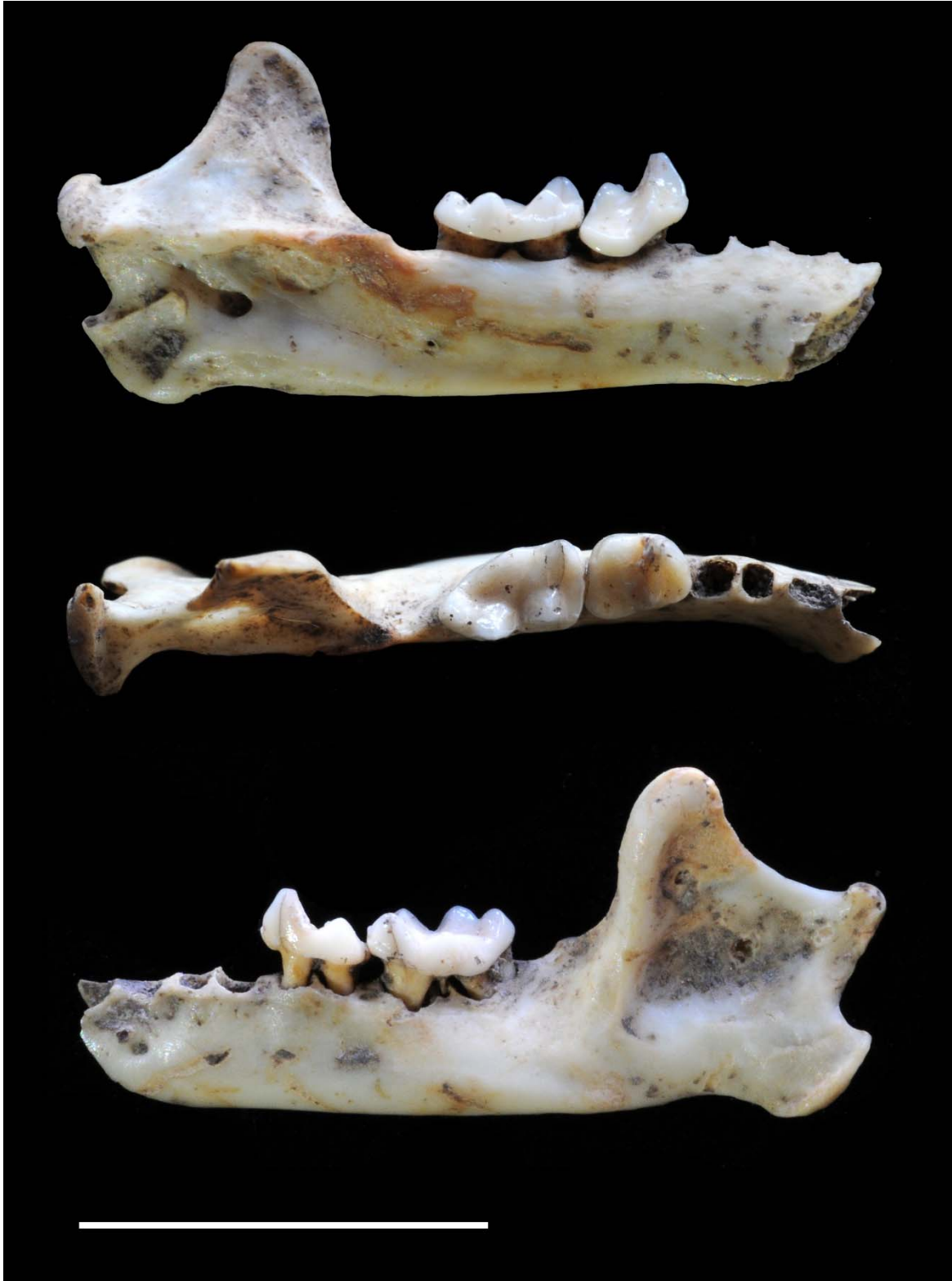
FIG. 1. Lateral, medial and occlusal views of left dentary of C. improvisum (FOL 00-C001) from the pre-Columbian site of Folle Anse, Marie-Galante (F.W.I.). Scale bar = 10 mm