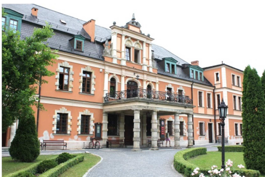
Figure 1. The manor house at Koberwitz, venue of Rudolf Steiner’s Agriculture Course of 1924.