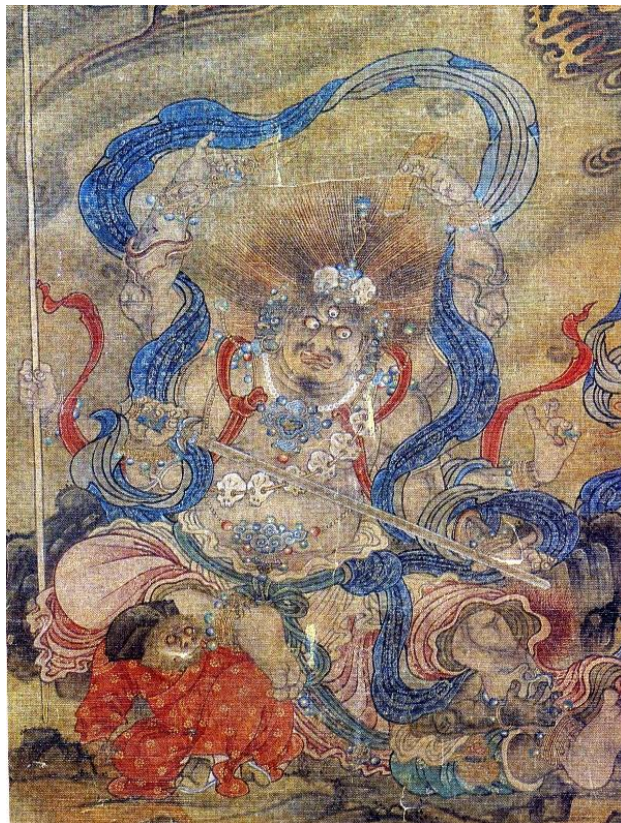
Ming painting of a 'Bright King' mingwang 明王 (Baoning si, 寶寧寺)

In the same way, the brutal appearance of the “red-faced dhuta ” in the erotic dream of Zhong Shoujing, following the more conventional transmission of a