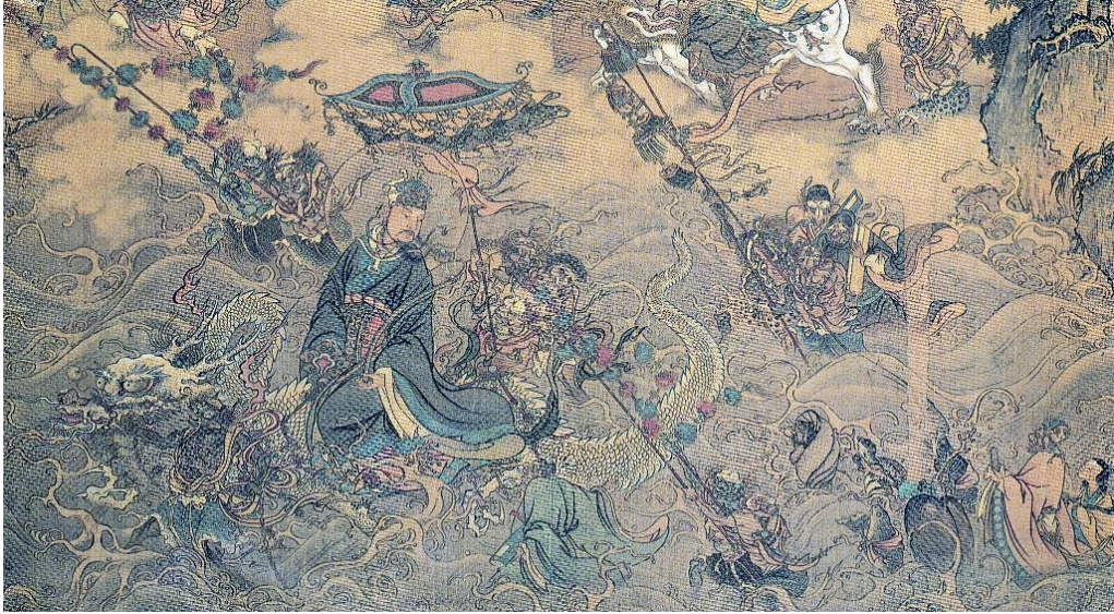
The Water Officer, shuiguan 水官