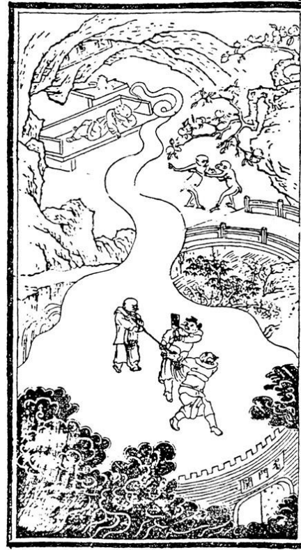
Picturing a chunmeng 春夢 (ill. for the play Huanhun ji 還魂記) and a yinmeng 陰夢 (Sun Wukong dragged to Hell in the Journey to the West 西遊記)