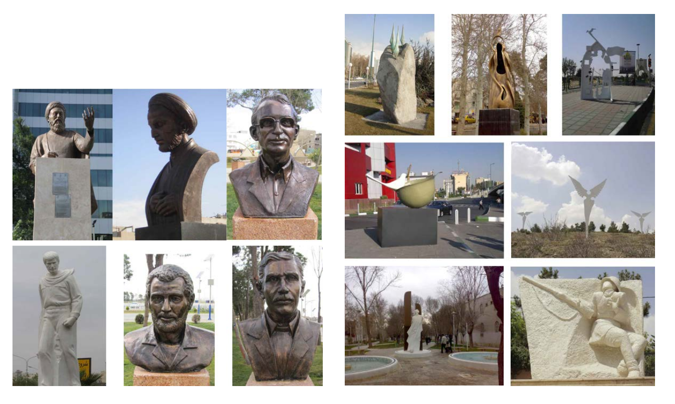
Fig. 06 Statues and busts of the martyrs of the revolution and war in the different parts of Tehran like Velayat Park, streets, highways and squares.