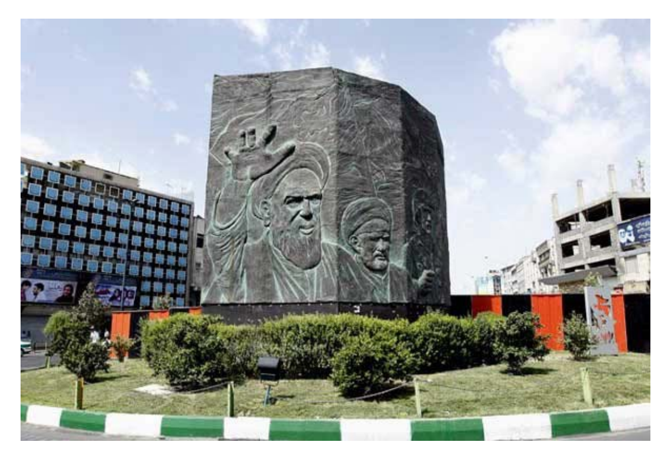
Fig. 04. A statue in the Revolution Square, as a round relief depicting the role of different groups of people.

(Eskandari, 2016). During the war, not only realistic and figurative statues were considered as a symbol of the previous regime, but also the sculptors were faced with the Islamic ban on making life-like statues; hence, symbolic revolutionary elements such as tulips, birds, and pigeons were used. The statues representing symbolic revolutionary elements were installed in city squares. In this period, the sculpture that remained from the former regime, but did not promote the Pahlavi doctrine, were reinterpreted in the light of Islamic and revolutionary concepts. For instance, the Bagh Shah Square in which the sculptures of Garshasb and a dragon were built to commemorate Azerbaijan's freedom was renamed to Horr Square<sup>2</sup>. To many of the viewers, the sculptures are reminiscent of Karbala - where the Ashura event took place.