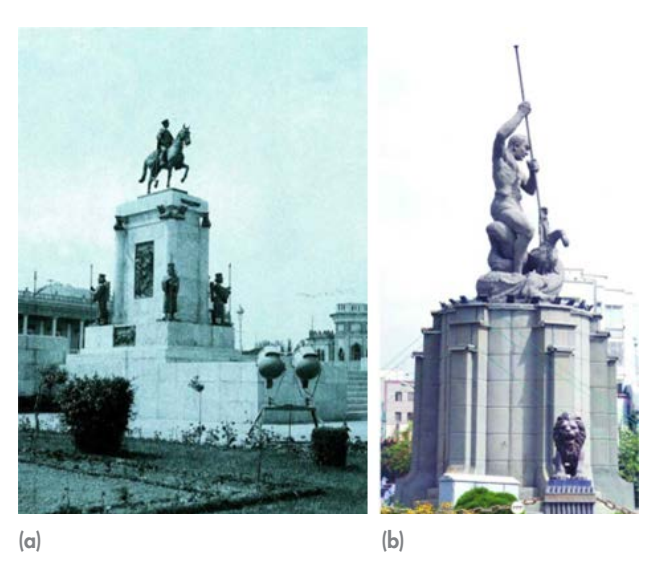
Fig. 02 · Sculpture of Reza Shah in the Rah Ahan Square in the south of Tehran.