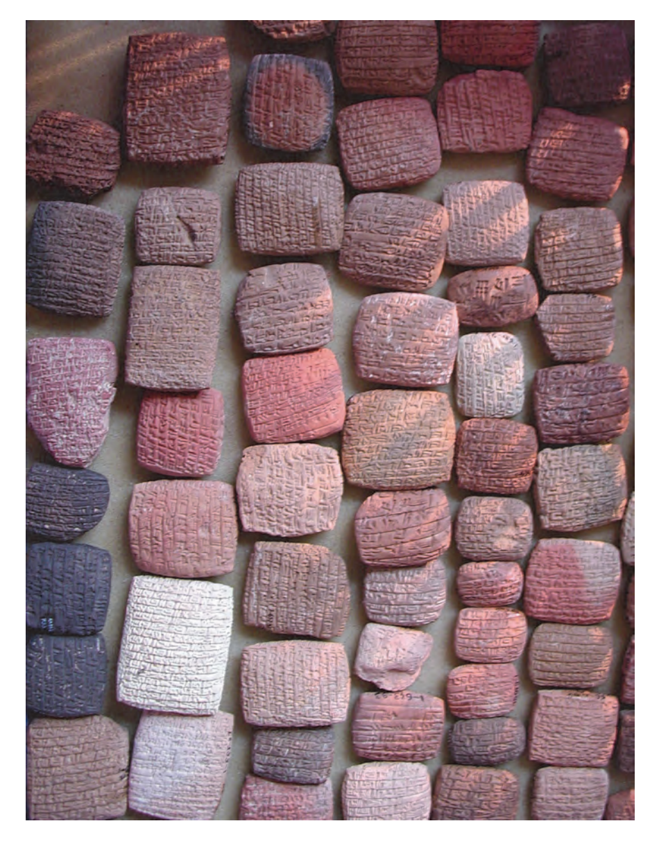
Fig. 3: Tablets belonging to the archives of Ali-ahum and Aššur-taklāku.