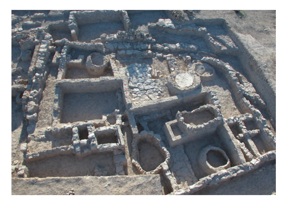
Fig. 2: Houses in the lower town.

Fig. 1: Roads in Anatolia and Upper Mesopotamia during the Old Assyrian period.