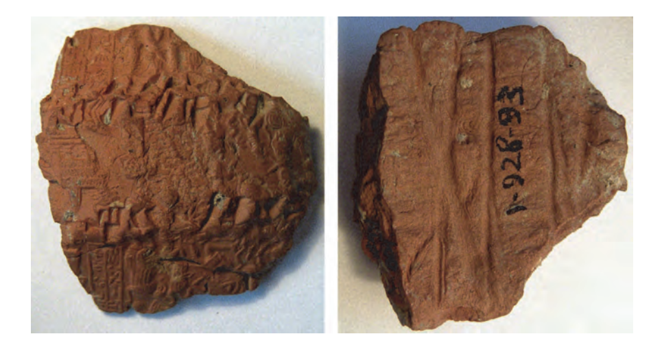
Fig. 4 : Bulla Kt 93/k 804. On the recto, the text mentions a shipment to a merchant whose name is broken. There are three seal imprints, two of them bearing the name of their owners, Puzur-Ana, son of Elālī, and Aššur-ṭāb, son of Ali-ahum. On the verso, there are traces of textiles and strings, suggesting that this bulla was attached to objects (tablets or merchandise) wrapped in a textile.