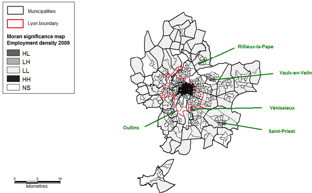
Map 1: Moran significance map for employment density (Queen weighting matrix)

We use the same methods to look at the distribution of population in the Urban Community of Lyon. The results presented in Appendix 2 show a similar distribution as the employment pattern: a concentration of densely populated districts in the city center (High-High spatial associations) and several areas where population concentration is higher than its neighbors (High-Low and Low-High spatial associations). After describing the distribution of both employment and population, the hypothesis of monocentrism and polycentrism are tested in the next section.