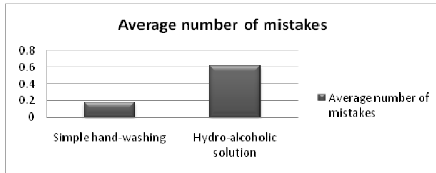
Figure 1. Impact of the hand-washing technique used Number of mistakes according to the hand-hygiene technique used – comparison of the use of a hydro-alcoholic solution and simple hand-washing.

F(1,24) = 2.49, p < .12 . The two groups of healthcare professionals were therefore grouped together for the remainder of the treatments. For both groups, the aim was to highlight the impact of the specific hand-hygiene technique used on the number of mistakes committed and the impact of the contamination risk factor on the choice of technique. Finally, the decision rules governing the choice of hand-hygiene technique were analyzed.