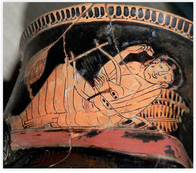
Figure 9 A symposiast reclines while playing a lyre. Detail of rim of Fig. 8.

might laugh, imagining the reference to erastai , or perhaps the more puerile references to male genitalia [68] . With the drinker masked as a dog, the other symposiasts are cast in the role of the hunted, the erômenos . This may also invert the status of some of the party-goers, causing a comic role reversal.