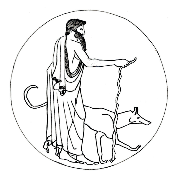
Figure 5 An erastês on the prowl. Interior tondo of an Athenian red-figure kylix, c. 480 B.C. Attributed to the Dokimasia Painter. BA 204493*, ARV2 412.11, 1651, Ferrara, Museo Nazionale di Spina T931A. Drawing: Michelle Ranta.

looking up at the youth. Sourvinou-Inwood notes that images such as these suggest that the actions performed by the other figures are done so under the power of Eros [46] . The idea that the erastês is pursuing the youth in the guise of a hunting dog is sharpened by the fact that Eros parallels the dog's actions in the composition. The dog must be a stand-in for the erastês here, but the boy is then also a hare, behaving like one being chased (he turns his head to look back), while performing the formulaic gesture of the target in a love pursuit [47] .