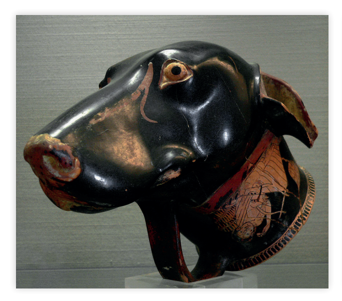
Figure 8 Plastic Athenian red-figure cup in the shape of a hunting dog's head, c. 480 B.C. Attributed to the Manner of the Brygos Painter. BA 9998*, Aléria, Musée Archéologique 67.467, 2170A.