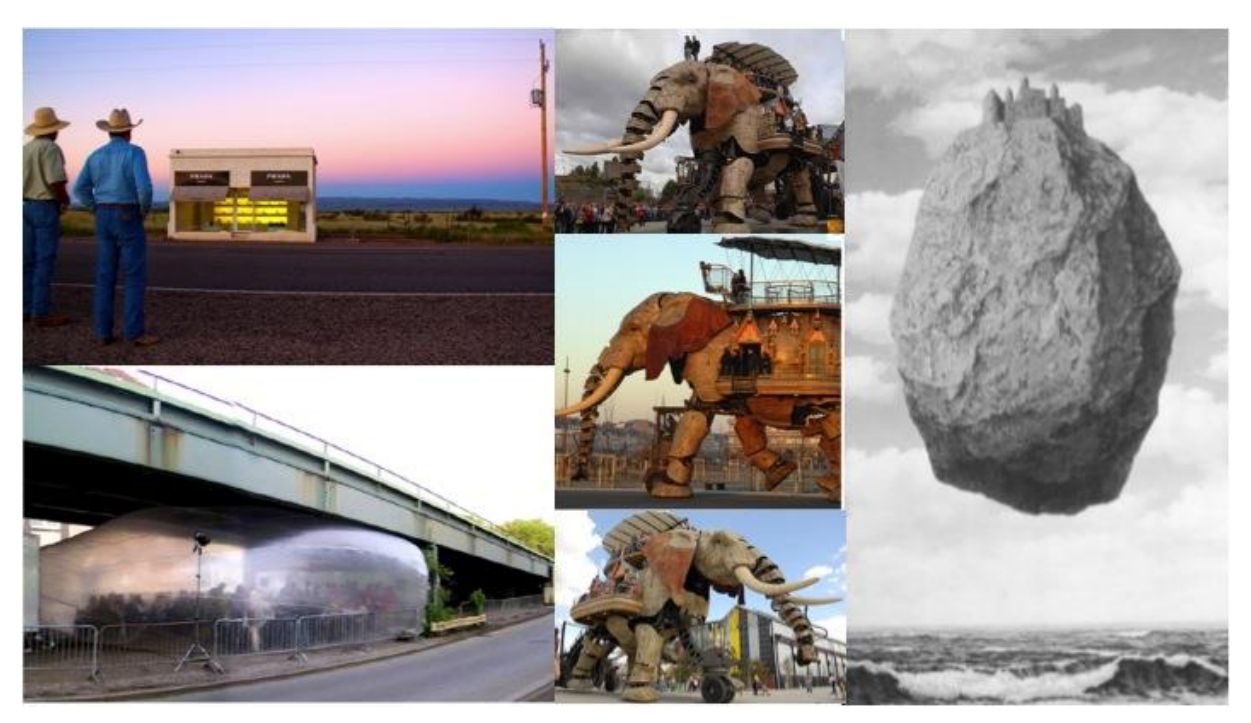
Figure 3: Prada, e-store, Texas ; The « Machines », cluster of creation, Nantes ; Space buster ; Magritte

• The urban and architectural design of the "Movida" will be artistic, spectacular and extraordinary, to provoke a both urban and social extremely unlikely situation. It is a "project event".