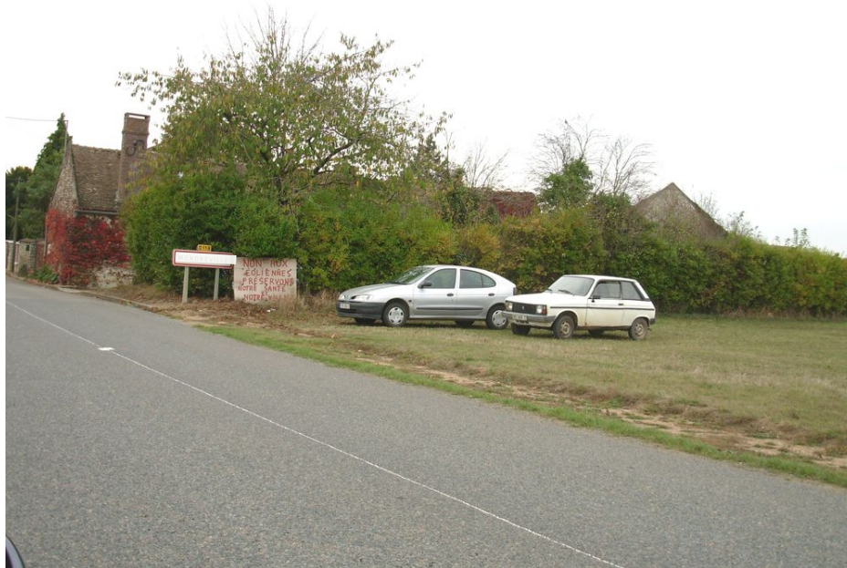
Figure 4. Protest poster against the wind power project at the entrance to Ventville