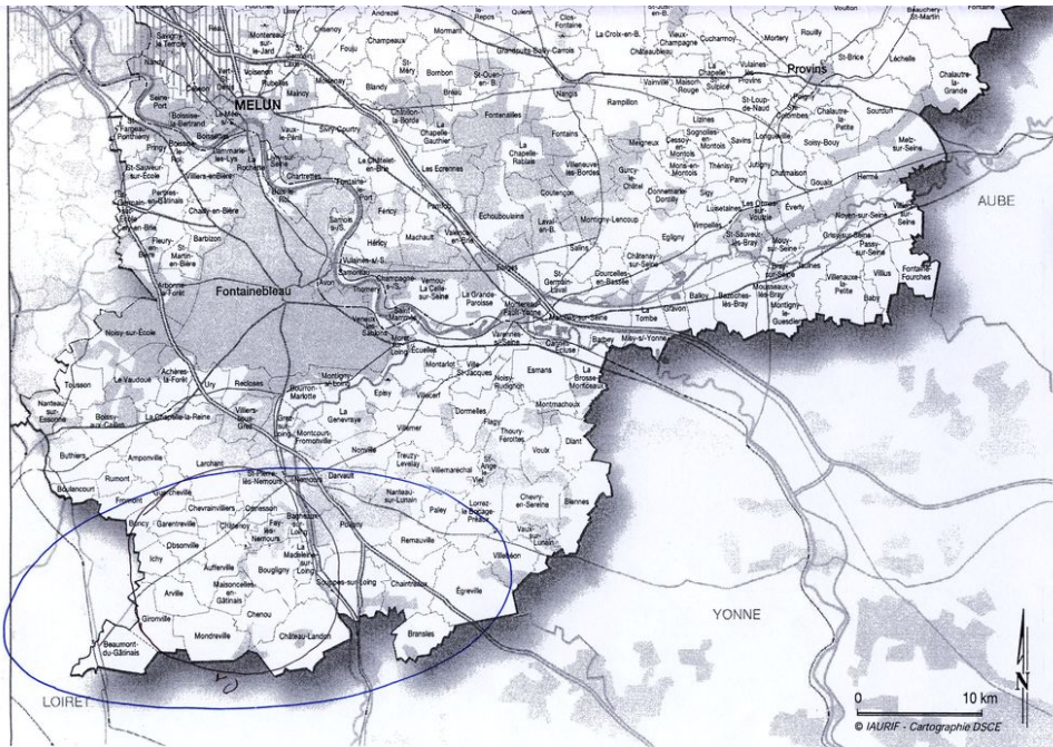
Figure 2. Ms. A. area of vigilance against wind power (circles) "This is all my zone [of refusal of wind power]. So here it's regional. I have covered all that 32 ."