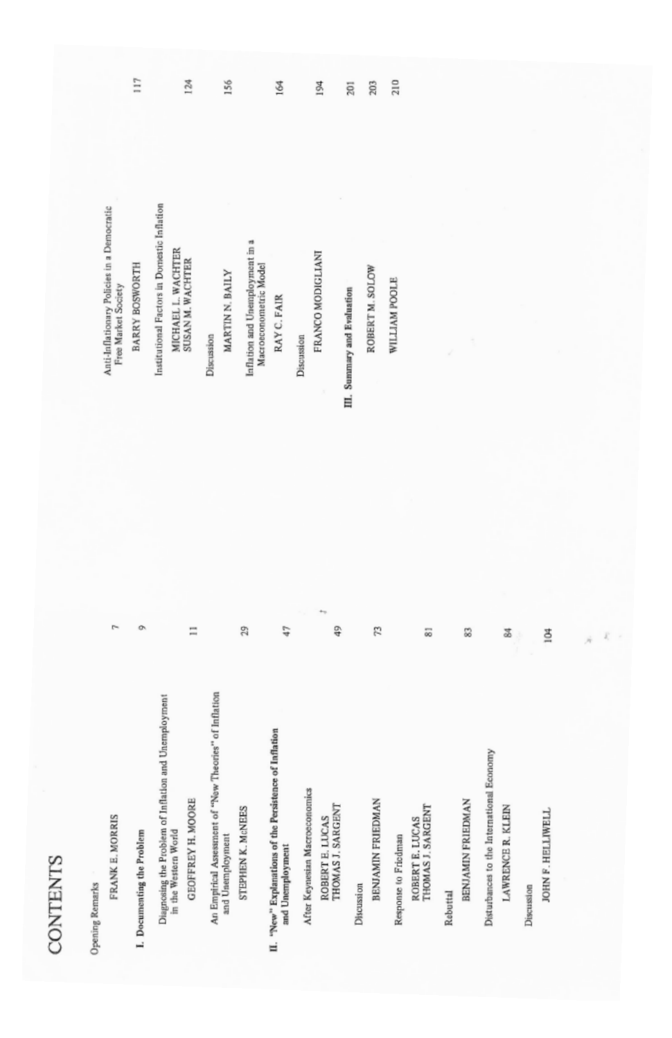
Figure 3: Contents of the conference (Boston Federal Reserve Bank, 1978, p.6-7)