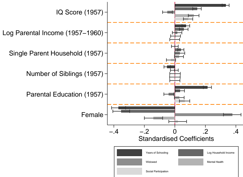
Figure 3: Distal-Proximal Channel Coefficients

Note: These coefficients come from separate regressions of each proximal variable on the set of distal variables. The five proximal variables that appear in each panel of the figure above are those with the greatest channel effect (the highest partial R^2 ). Lines around the bar represent a 90% confidence interval. The full regression results appear in Appendix C.