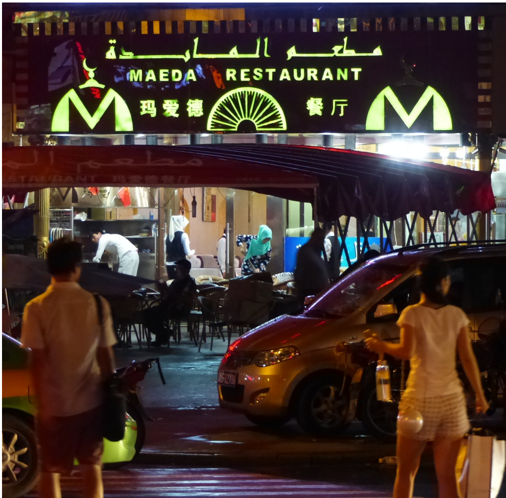
Figure 2: El Maedah, First Arab Restaurant in Yiwu