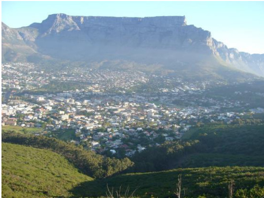
Photo 1: View of Table Mountain from Signal Hill (04/03/09). The City Bowl reinforces the image of affluent area isolated from the rest of the metropolis.

Photos 1 and 2: City Bowl and Cape Flats, when topography emphasises socioeconomic differences.