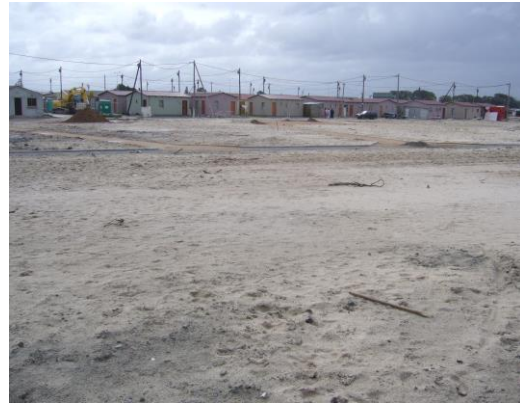
Photo 2: New Rest in Gugulethu (30/08/08). The Cape Flats are well-known for being flat and sandy.