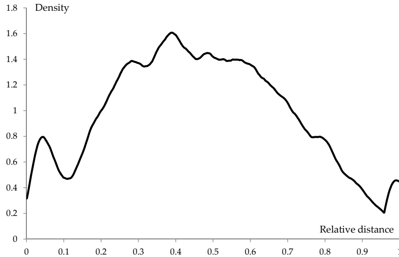
Figure 1: Probability distribution function of the relative distance for new constructions, French urban areas 2006-2012

Notes: All years of data used. 218,657 observations. For each new construction, we compute the distance between the centroid of its municipality and the centroid of its urban area and divide by the greatest observed distance for any new construction in this urban area.