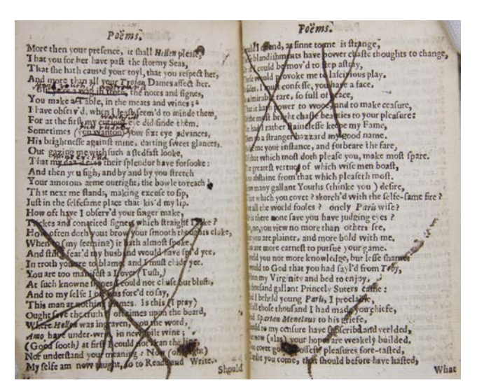
Fig. 9 - Meisei MR 1447, sigs. 17v-18r

These would provoke me to lascivious play. Besides, I must confesse, you have a face, So admirable rare, so full of grace, That it hath power to wooe, and to make ceasure, Of the most bright chaste beauties to your pleasure: (Fig. 9)