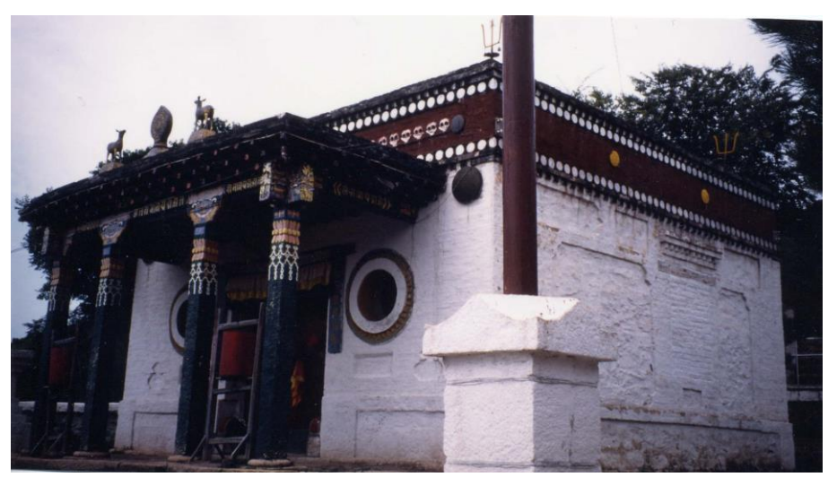
Fig. 10. Gembi-yin süme (Genpimiao, Arqorcin Banner). Temple rebuilt with concrete and baked bricks, concrete pillars painted green.