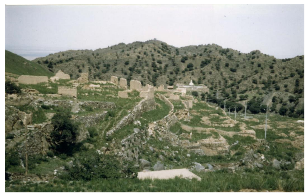
Fig. 9. Barayın keyid, ruins.

stupas are frequent. Metal-sheet roofing (previously unknown in Inner Mongolia) may be seen in Barγu (Kölün Buir)—perhaps owing to the influence of certain religious edifices in Ulaanbaatar.