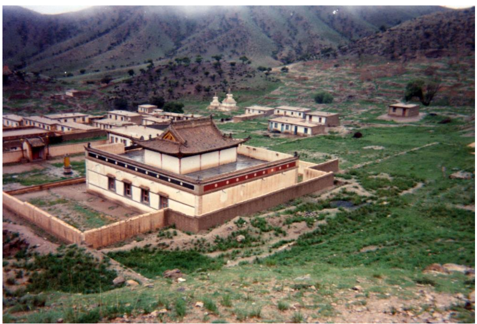
Fig. 8. Barazun keyid (Helanshan nansi, Alashan Left Banner, in the Helanshan mountains): assembly halls are rebuilt in front of the ruins.

Since there is no information available on the exact number of non-official, locally rebuilt monasteries and temples, I can only describe the places I visited, which I hope will nevertheless give an idea of the diversity of conditions and alternatives. In 1981, twenty monks (several of whom have studied in Amdo) together with a group of local laymen began to collect funds to rebuild the famous Baraγun keyid (Alaša), which formerly housed the funerary stupa of the Sixth Dalai Lama. <sup>56</sup> Although the stupa was destroyed, the monastery has remained one of the most sacred sites in Alaša. ( Fig. 8, Fig. 9 ) The assembly halls of Jegün keyid and of Lobunchinbu süme (one of the few Nyingmapa monasteries in Mongolia) have also been rebuilt on the ruins of the previous sites, together with seven other monasteries in Alaša.