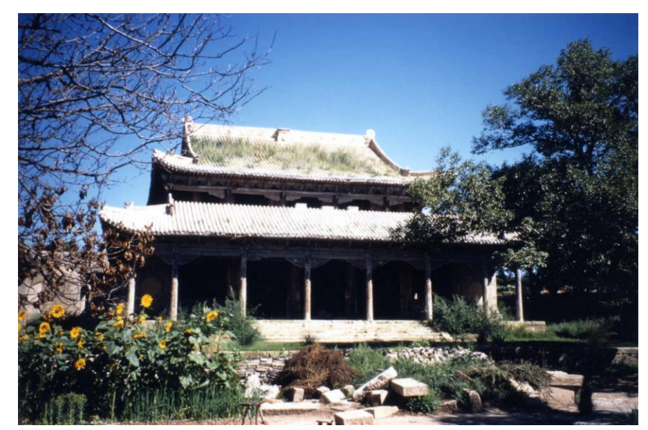
Fig. 5. Fanzongsi (Ongni)ud Banner, Juu uda league, now in Chifeng league): an example of protected mummified monastery