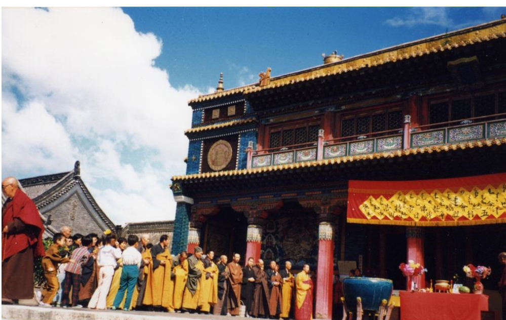
Fig. 2. Festival in Siregetü juu, summer 1995, with Chinese heshang and lay believers, summer 1995.

The five-day festival of Aršan süme attracts herdsmen from all the surrounding countryside. According to Alexandra Marois, a French anthropologist who attended the festival from September 19<sup>th</sup>-24<sup>th</sup>, 1999, the monks insist on the importance of walking the last few kilometres to the monastery (it is the first question they ask visitors upon their arrival). Most visitors come for just one day. No Chinese attends the festival. The pilgrims circumambulate the monastic complex turning their prayer-wheels, prostrating and making libations with baijiu (Chinese distilled sorghum alcohol), some bearing sacred books on their backs. They offer hand-sewn coloured nom-un debel (cloth-covers