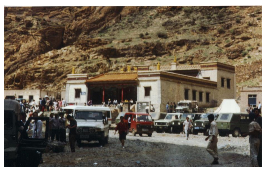
Fig. 3. Festival in Lobunchinbu süme, summer 1995

for sacred books) and food, and in return receive blessings, sacred water and herbal remedies. They buy wind-horse flags which they hang on the northwest side of their yurts.<sup>32</sup> Private consultations also take place inside the monks' cells. In the courtyard of the monastery itself, the monks were selling the gifts they had just received (prayer rugs, debel )! An unusual feature is the presence of meat offerings (mutton) on the altar of a lateral shrine.