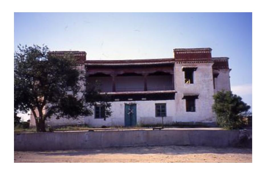
Fig. 4. Balcirud süme (Arqorcin Banner, Chifeng League): an example of temple transformed into housing. The porch has been closed on the ground floor.

has been to negotiate the right of use with the occupying administration, school, factory, warehouse, prison, families, etc., which must be relocated. The rehabilitation of religious sites initiated by the authorities and limited to the main historic and scenic monasteries was soon followed by a growing demand from local communities to reopen smaller temples and monasteries. These demands are granted on a certain number of conditions: local religious leaders may reopen an existing temple or monastery, but not establish a new one (in theory)<sup>34</sup>; they must constitute a Democratic Management Committee with elected members<sup>35</sup>; the monastery (or temple) must be economically self-sufficient, located at a famous historical site, in areas where there is a concentration of religious believers and the opening must be approved by the local authorities. 36 The local community is responsible for the buildings' maintenance<sup>37</sup> but is nevertheless required to follow the directives of the Department of Cultural Heritage, Urban Planning and other administrations, and any renovation, reconstruction or extension must be approved beforehand by the aforementioned administrations. Existing structures cannot be demolished. Authorisations are required to set up a business, a restaurant, a shop, or a publishing office.<sup>38</sup> Locally rebuilt monasteries are registered as "cultural heritage."