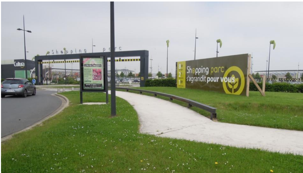
Figure 12: The Carré Sénart, south of Paris, in Île-de-France: this ‘shopping parc’ was designed by the planners of Sénart new town to be the centre of the whole development

Within that context, in both France and Canada (albeit in different guises) suburban regimes that have historically been formed in contradistinction to the central city have recently been freeing themselves from the inside–outside duality traditionally characterizing their political frame. The increasing recognition of regional and ‘in-between’ issues, particularly in policy sectors such as transportation, welfare, ecology and housing, has led to an increase of rhetoric (if not action) regarding cooperation between suburbs and the central city on one hand, and coordination in a competitive regional environment among suburban municipalities in decentralizing regions on the other (Lehrer et al., 2012). These logics articulate themselves in variable configurations depending on context. In France, for example, while inner- and middle-ring suburbs clearly have an urban identity, and are often integrated into metropolitan communities ( communautés urbaines ) in which the core municipality cooperates with its neighbouring municipalities, periurban areas retain a more rural identity and tend to adopt a defensive stance against the city.