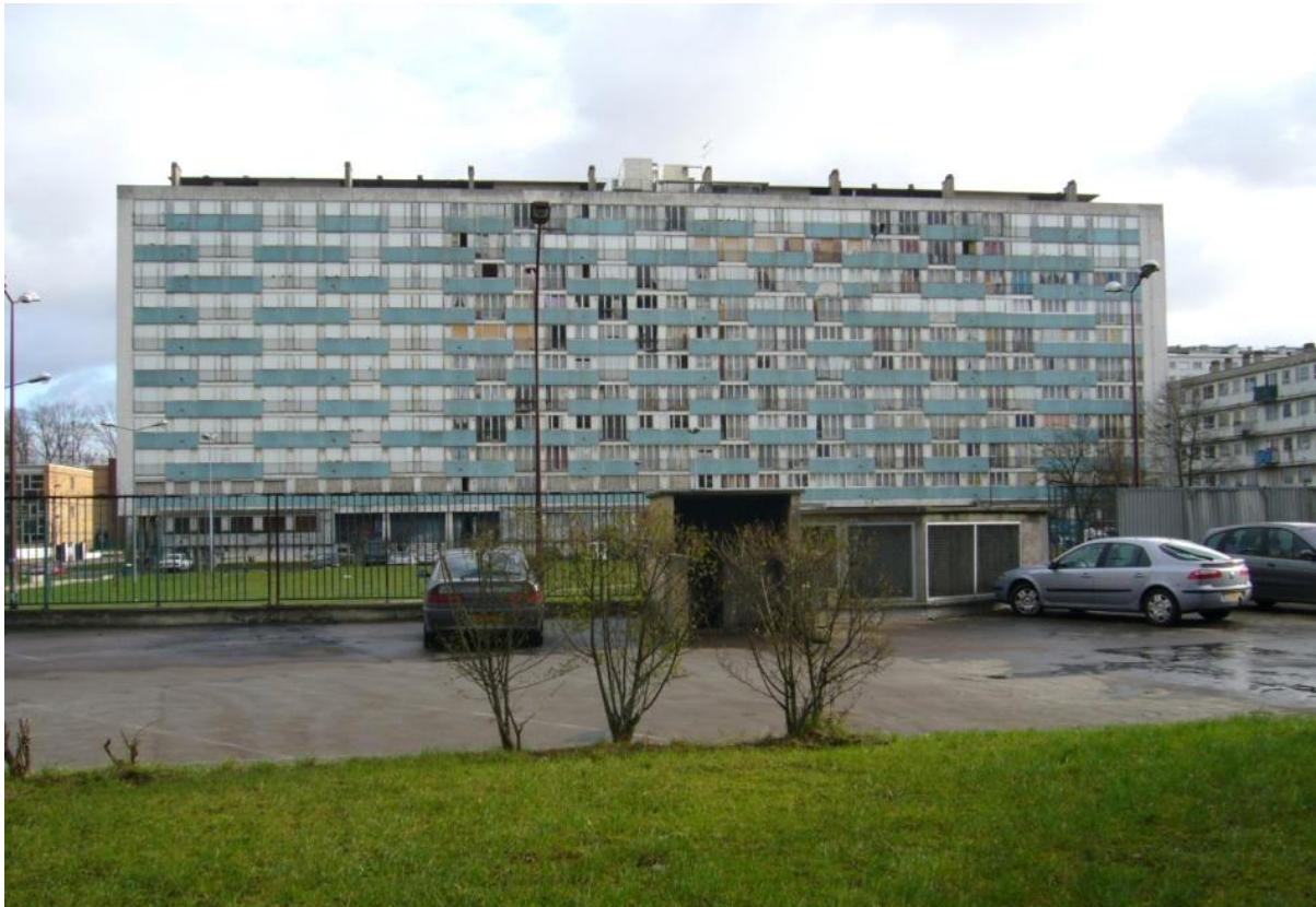
Figure 3: A barre in Montfermeil: the building is a condominium and a process of acquisition by individual residents is underway