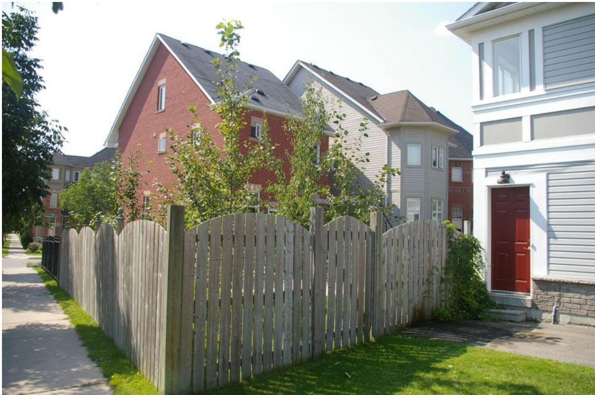
Figure 5: New urbanist development in Markham, Ontario

The debate presented here focuses on densification. Densification is by no means the only morphological change that affects suburbs and post-suburbs, but it is certainly among the most discussed strategies within the planning community. The densification of residential suburbs is commonly considered a key objective. It is evidenced in France by the so-called 'Grenelle 1 et 2 de l'environnement' legislation, enacted in 2009 and 2010. Grenelle 2, for example, permits a minimum level of density, especially in areas close to public transport links. Such dispositions are almost unopposed, either from the left or from the right (at least at national level). In the next section of this introduction, we present the politics behind this consensus in favour of densification. As we will see, much recent research points towards a questioning of the relationship between density and sustainability. A re-politicization of the anti-sprawl discourse within urban planning can be expected from this turn in the debate.