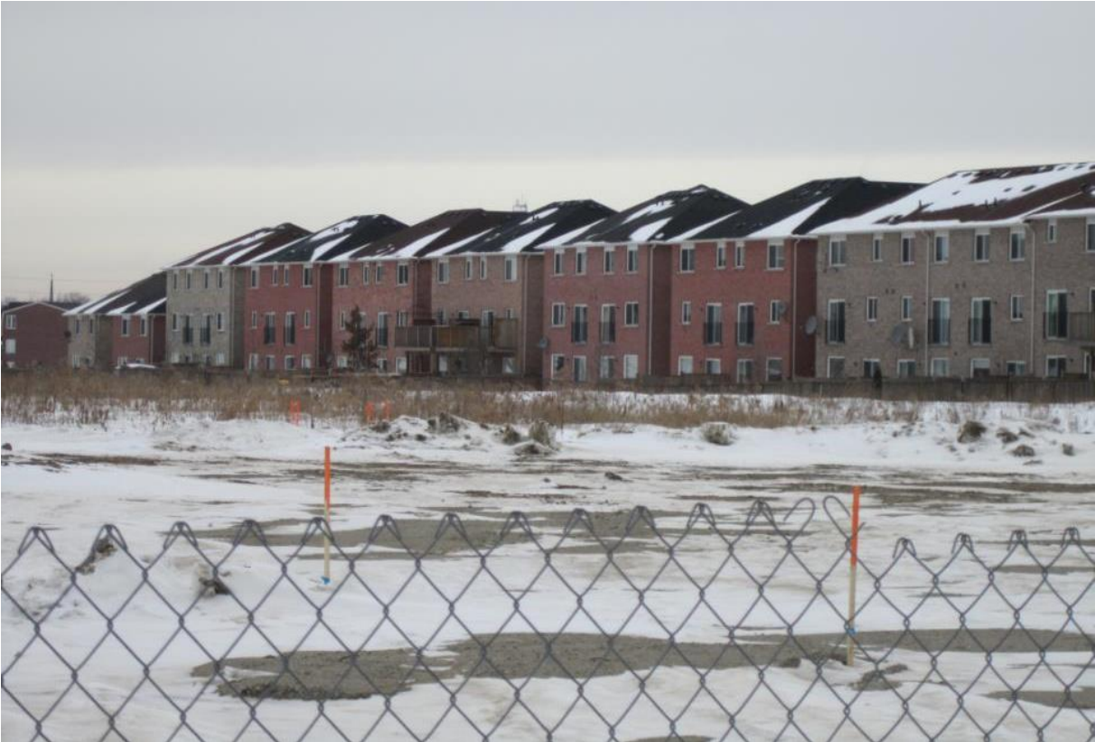
Figure 6: Infill at former industrial site in eastern Toronto inner suburb of Scarborough

Living in a low-rise residential space is no longer perceived as being about getting closer to the countryside, rather it is deemed unfriendly to the environment. Yet the arguments behind this reasoning are debatable. There is insufficient space here for a comprehensive discussion, but recent