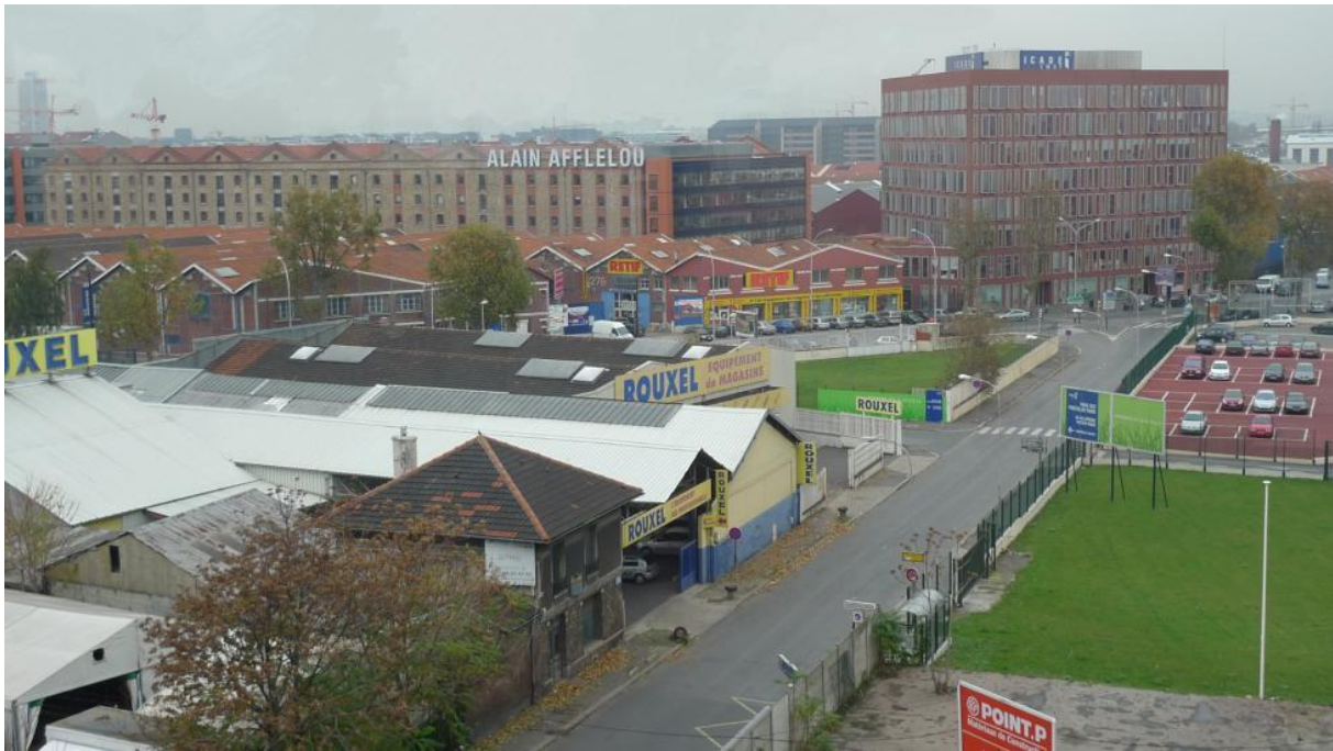
Figure 7: Redevelopment of former industrial land in Plaine Saint-Denis, close to Paris city limits

Such disqualification of local opposition to growth is questionable. In fact, behind the motivations associated with sustainable development, and more specifically behind the equation that density equals a sustainable city, often hides the old conflict between exchange value and use value (Logan and Molotch, 2007 [1987]). The defensive politics of suburbanites vis-à-vis continuous development is not just a defensive stance of private interests; 'such a politics also recognizes the constraints of the jumbled, anaesthetic environments [of post-suburban in-between cities] as the true playgrounds of a new and potentially productive politics of the urban region' (Keil and Young, 2011: 77). Within that politics, citizens have learned to suspect other special interests behind the positions put forward. Thus, the idea that growth is good for a local community is often obliterated by the notion that this growth serves the interests of developers (growth is greed, to put it bluntly). From this point of view, defending one's suburban 'castle' against higher density is perceived by observers to be a defence by 'the little guy' against the greed of developers and those financing their projects. This local perspective appears all the more legitimate since there is a growing interest in local policymaking processes, in conjunction with the rise of participatory forms of democracy.