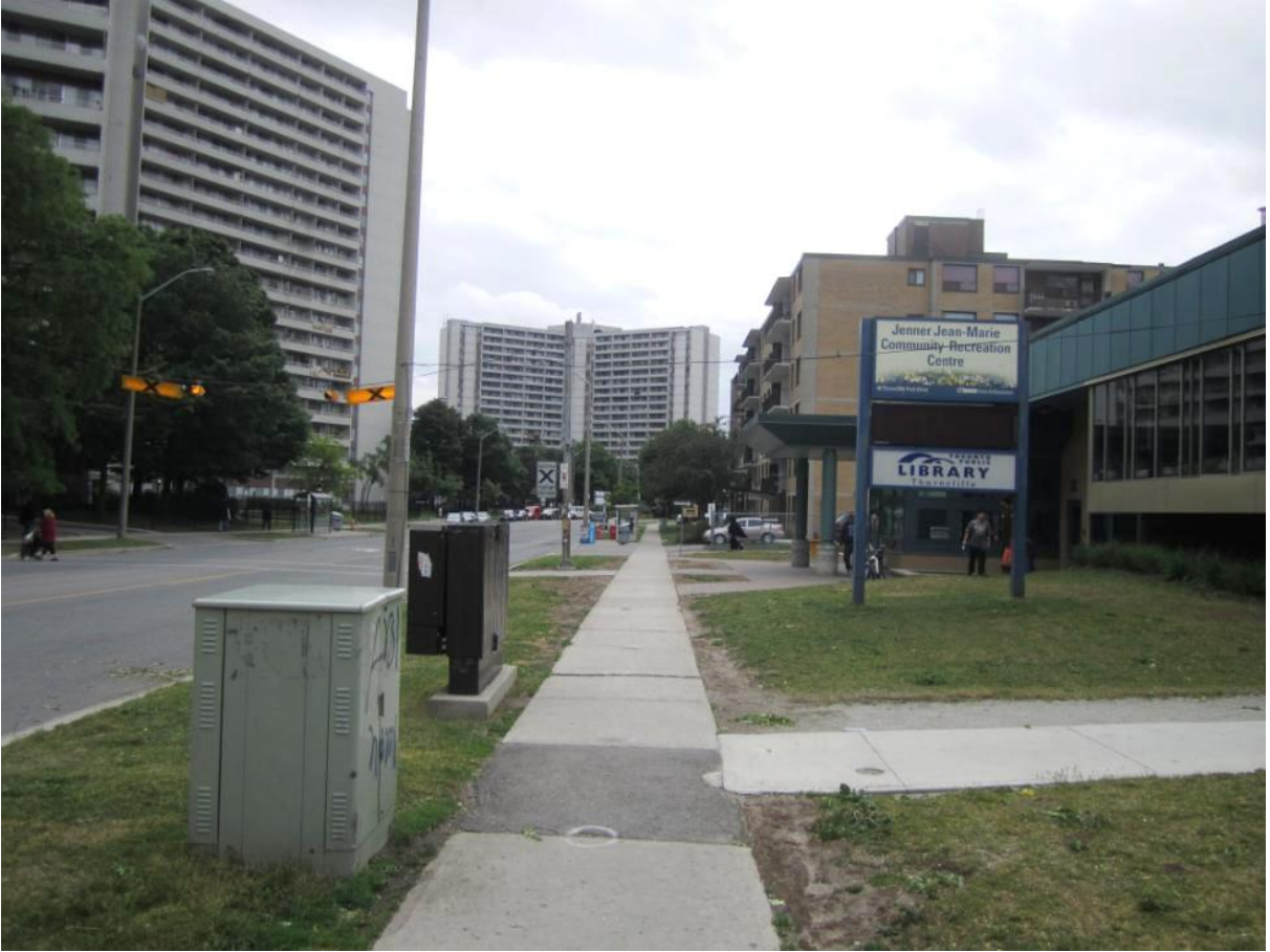
Figure 4: Toronto tower neighbourhood: Thorncliffe Park

Finally, the four essays to follow in this debate focus on transformations in residential space. This choice is, above all, practical: by limiting the diversity of cases, we facilitate significant comparisons (although the terrains under investigation were limited to two countries). That said, this choice is not meant to reduce the suburbs to their residential status. As is well documented, the suburbs do not consist of housing alone. For quite some time, they have brought together employment, commerce, cultural organizations, infrastructural and logistical facilities, ecological spaces (parks and greenbelts) and large-scale institutions such as hospitals and universities. These changes are at the very heart of the move from suburbanization to post-suburbanization.