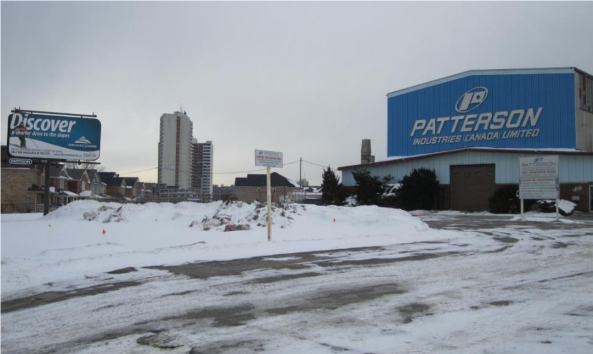
Figure 11: Industrial-residential mix: industrial plant in eastern Toronto suburb with encroaching high-rise and single-family-home residential development

In any case, suburban politics is not only about residential qualities of places. The suburbs have historically often lacked employment. Gradually, however, the work commute has been reconfigured: the suburbs to centre transportation flow has lessened as more people commute from suburb to suburb, or even from centre to suburb, following employment opportunities in Fordist factories and post-Fordist manufacturing, logistics and office locations, as well as commercial and entertainment enterprises (see Figures 7, 11 and 12). In parallel, during the decades following the second world war, governments sought to organize suburban growth by creating new settlements and satellite cities.