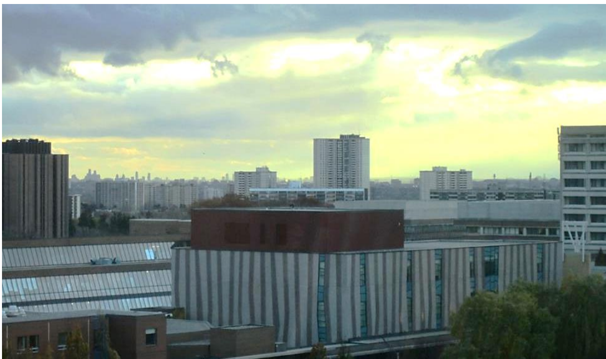
Figure 2: In-between city Toronto: York University campus at the northwestern edge of Toronto looking south

In this contribution to Debates & Developments in IJURR , we specifically focus on densification as a particular dimension of (post-)suburbanization. This introduction and the four essays that follow make no larger claims about suburbanization in France and Canada or even their comparative trajectories. Yet we do think that these essays have significance in engaging critically with the strategic and normative preference for density and compactness in a sustainability paradigm that often remains unchallenged on both sides of the Atlantic. In this context the Canadian and French examples, and their comparison through the work presented here, is valuable. Low-density morphological patterns have not only been at the heart of the original programme of suburban utopia with its setting of pastoral life (Fishman, 1987), but they are also key to understanding the recent transformation of suburbs. Yet in both national contexts under review here, Canada and France, higher-density peripheral development has also been part of the development regime since as far back as the 1960s. More recently (and most relevant to the debate presented here), densification, along with ‘compactness’ and ‘intensification’, have become buzzwords in urban planning.