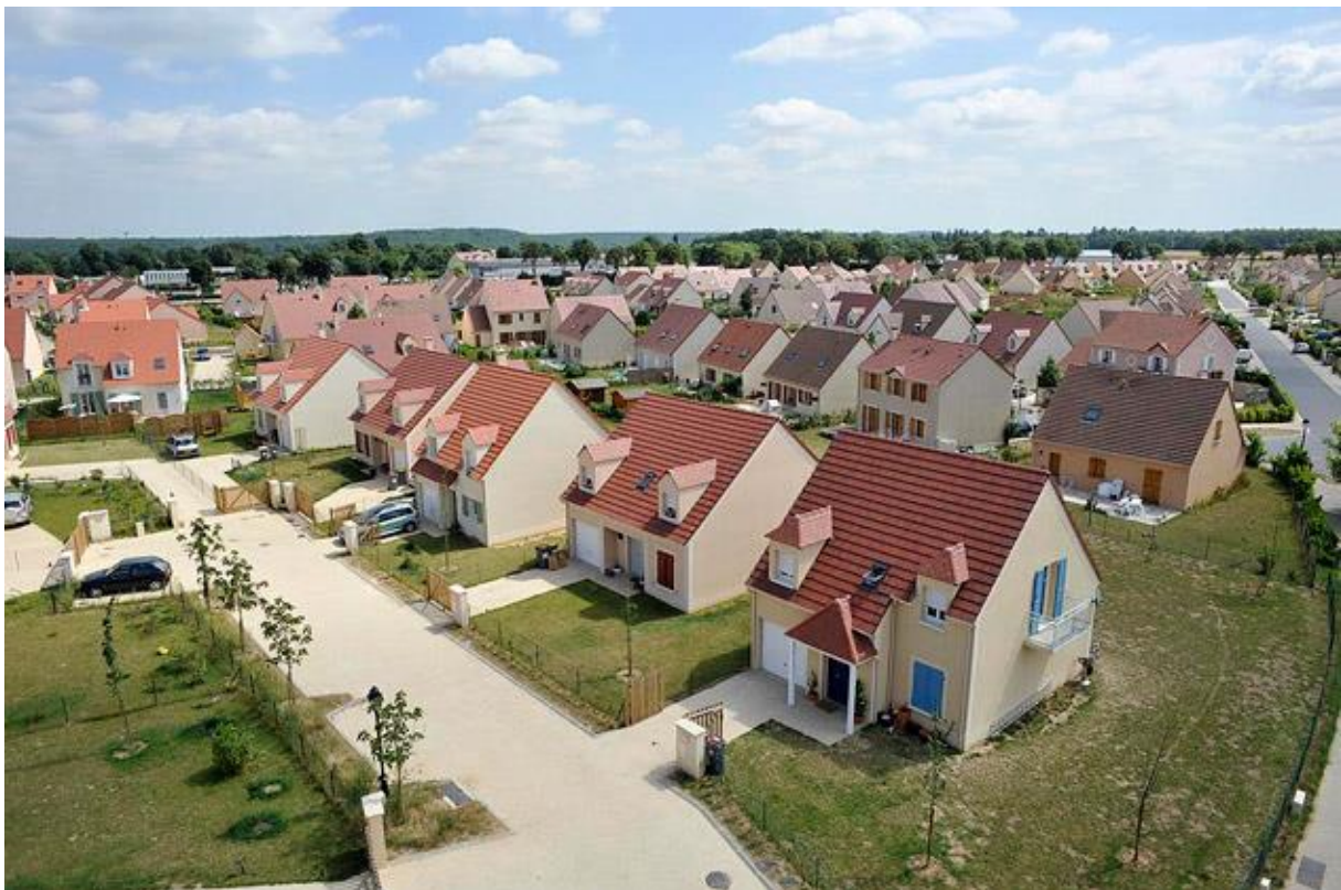
Figure 1: An artist’s view of an archetypical outer-suburban development in France (Jean-Pierre Attal, intra-muros 12, 74x100 cm, 2008, www.jeanpierreattal.com )

As the growing literature on post-suburbs shows, such processes are by no means ignored. We can consult the most comprehensive and influential recent contribution to the debate on post-suburbanization in the introduction to a recent collection of studies on the subject by Phelps and Wu (2011a). In this view, post-suburbanization refers primarily to an era involving a double re-definition of classical suburbia: a ‘maturation’ of the suburbs and a host of new influences changing the nature of those areas. Some interventions, like the extensive literature on Los Angeles since the 1980s, have gone so far as to claim an epochal shift in urbanization patterns. More broadly, however, post-suburbia entails the notion of a reversal of the linearity of historical processes, as traditional geographical