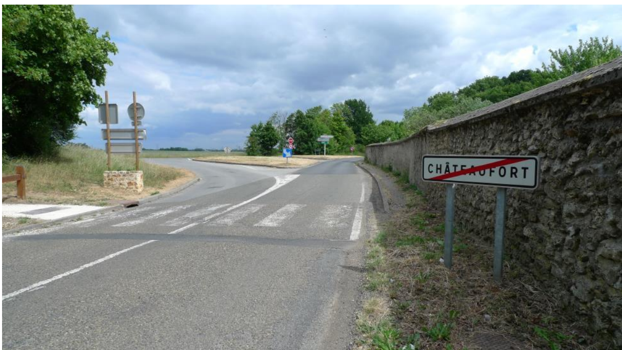
Figure 10: Driving out of a small periurban commune (a territory governed by a municipality) in the first periurban ring of Paris

Everywhere, residents mobilize to preserve the landscape and maintain certain social qualities of their local communities. Such resistance has become very important, both in North America and in Europe, as evidenced by the literature on nimbysism or no-growth coalitions (Subra, 2007). This resistance represents an extension from the home to the local environment of the domain over which people consider that they have property rights. Householders do not only buy a home, but also the local environment that comes with it. Through that process, the relationship to the neighbourhood becomes more and more similar to one of co-ownership, a process we described as 'clubbisation' (Charmes, 2009). This process is one of the main driving forces powering not only residents' movements, but also the development of private residential neighbourhoods and gated communities. And in the case of France this process has a significant effect on municipalities.