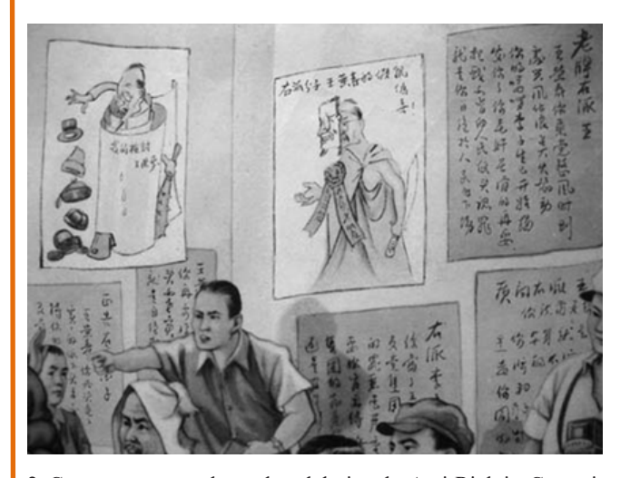
2. Cartoon propaganda produced during the Anti-Rightist Campaign

repeated in the "Resolution" of 1981, in which the campaign was presented as "absolutely correct and necessary," in spite of its "excesses." 17