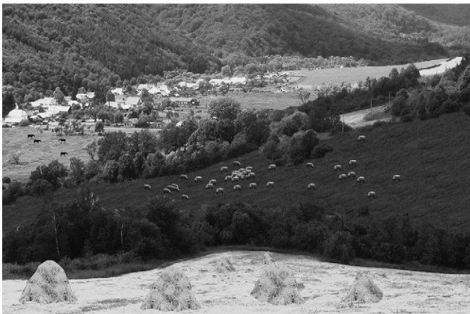
Fig. 2–4. Example of a scenario visualisation series from the Slovakian study area. 2. Business as Usual; 3. Agricultural Liberalisation; 4. Managed Change for Biodiversity (photographs: P. Bezák, photo editing: Martin Boltziar; note that full colour prints were used for the stakeholder assessments).

the study areas will continue into the future. It further assumes that these trends will take place at a similar rate and to a similar extent, with no dramatic changes to the core principles of current policies. While it rests on the proposition that the occupancy of the land by farmers is important to ensuring rural stability and the delivery of certain biodiversity goals over the next 25 years, it also contends that agricultural restructuring will continue along established trajectories, leading to farm amalgamations and the abandonment of marginal land. In terms of biodiversity, the progressive marginalisation of agricultural land is expected to have negative consequences on open-land species, but on the other hand, the assumed strengthening of agri-environmental schemes is likely to benefit biodiversity. The magnitude of the biodiversity consequences varies between the study areas.