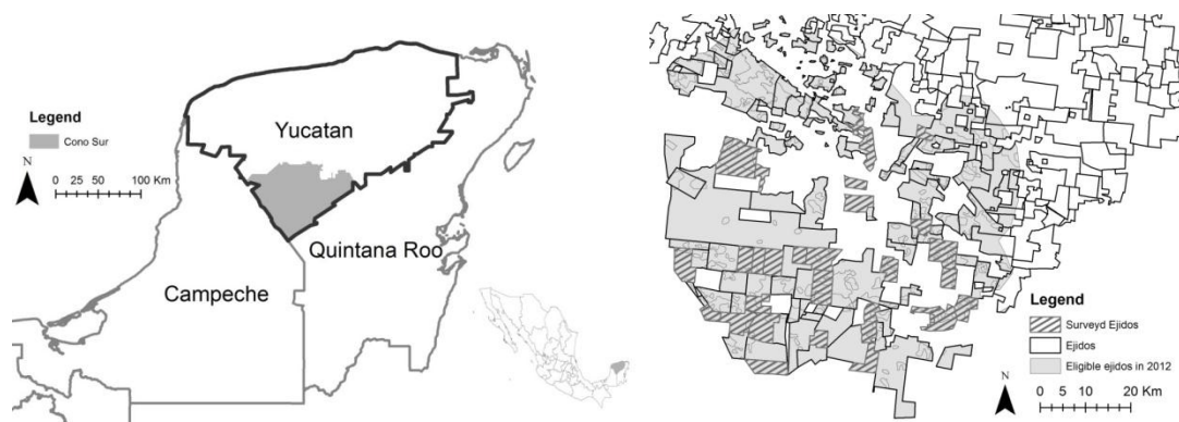
Figure 2: The Cono Sur of Yucatan

Ejidors from the southern part of our study zone lack basic infrastructure such as roads, running water and electricity and have been partly deserted by the population. This has led to the formation of labor- ejidos where ejidatarios maintain economic activities but live in the nearest city. In our sample, about 45% of the households do not live in their ejido . The average size of an ejido in our sample is about 2,500 ha and the average number of ejidatarios is 75.