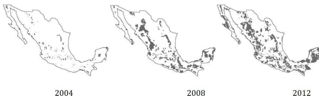
Figure 1: Evolution of eligible areas

The above elements tend to show that CONAFOR conceived the PSA-H as a compensation mechanism as it targets threatened forest and as the amount of payments are intended to reflect income loss attributable to conservation. As highlighted above, interactions with civil societies and other groups of interest forced CONAFOR to consider other conceptions of PES and integrate new objectives. This hybridization may be responsible for the low additionality observed in the early cohorts of beneficiaries (Muñoz-Piña et al., 2008; Muñoz Piña et al., 2011; Alix-Garcia et al., 2012). Nevertheless, Sims et al. (2013) highlight that, through adaptive management of the targeting criteria, the designers succeeded over time at combining both objectives.