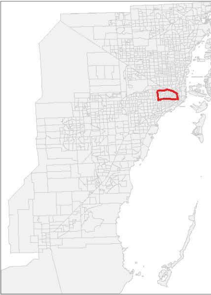
Little Havana in the urbanized Miami-Dade County