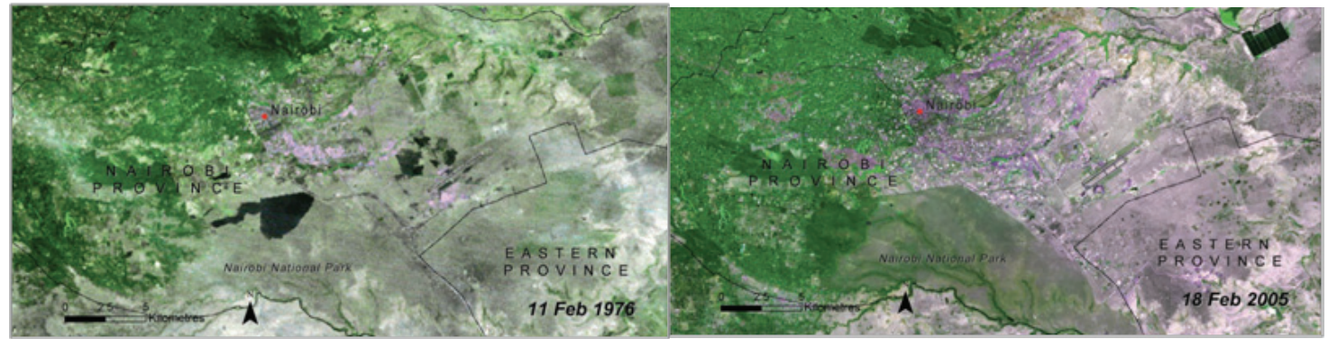
Figure 3: The Gazetted boundaries of NNP have proven to be effective barriers to land-use change within the protected area

Second, these historical boundaries demarcate but a small portion of the broader natural system, and the protection they afford does not extend to the adjacent areas of high conservation value. Seasonal wildlife migration extends to the south, where traditional pastoral practice has largely maintained the open space necessary for the viability of these movements. Today though, this migration is hindered by incremental land changes to land-use outside NNP, and the formal territory of this protected area is alone insufficient to guarantee the healthy function of its ecosystem.