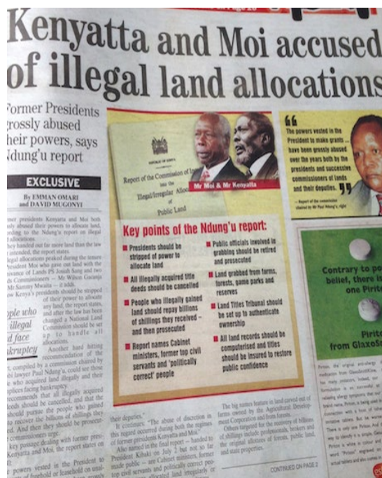
Daily Nation , 7th October 2004

an independent body to take over some of the key functions of the Ministry of Lands and existing abuses. Furthermore, the Njonjo Report recommended that improper allocations be suppressed, and in some cases the land given back to its original owner. The Ndung'u Commission asserts that "sanctity of title depends on its legality and not otherwise. A title acquired illegally is not valid in the eyes of the law". 10 The Ndung'u Report was very documented, showing how Kenyan public officers had betrayed the Public Trust Doctrine in the allocation of public land. It recommends the establishment of a Land Titles Tribunal that would embark in the process of revocation of unlawful titles; it also suggested that a National Land Commission (NLC) be created and vested in the power of managing the allocation of public and trust land. Other crucial recommendations thereafter enshrined in the Policy were: the impediment for foreigners to own land, allowing only leasehold titles in urban areas and recommending the minimization of the delay in granting a renewal.