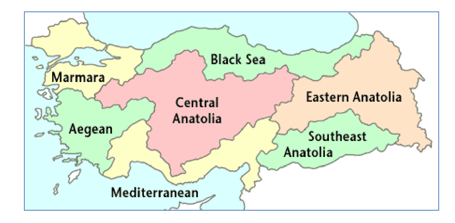
Figure 2.Map of Turkey