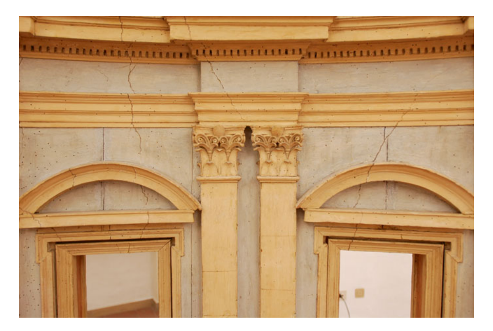
Fig. 3 Detail of the wooden model of Michelangelo's dome, showing painted "cracks" in the structure by Luigi Vanvitelli

Fabbrica was present. This was contrary to the normal custom of the institution, which required any work in or on the Basilica to be approved by a committee of its members.