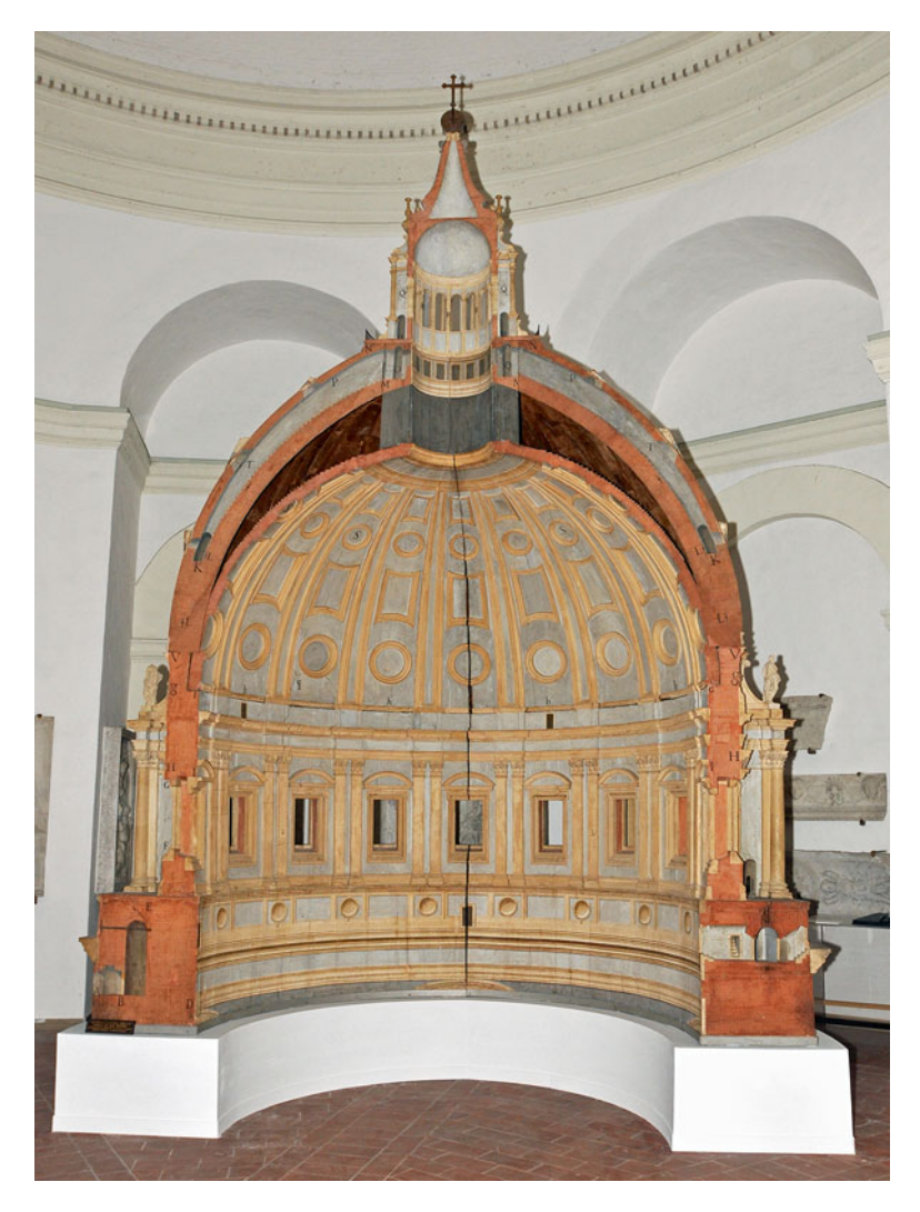
Fig. 2 Wooden model of Michelangelo's dome of St Peter's basilica, 1558–61, with later additions by Giacomo della Porta