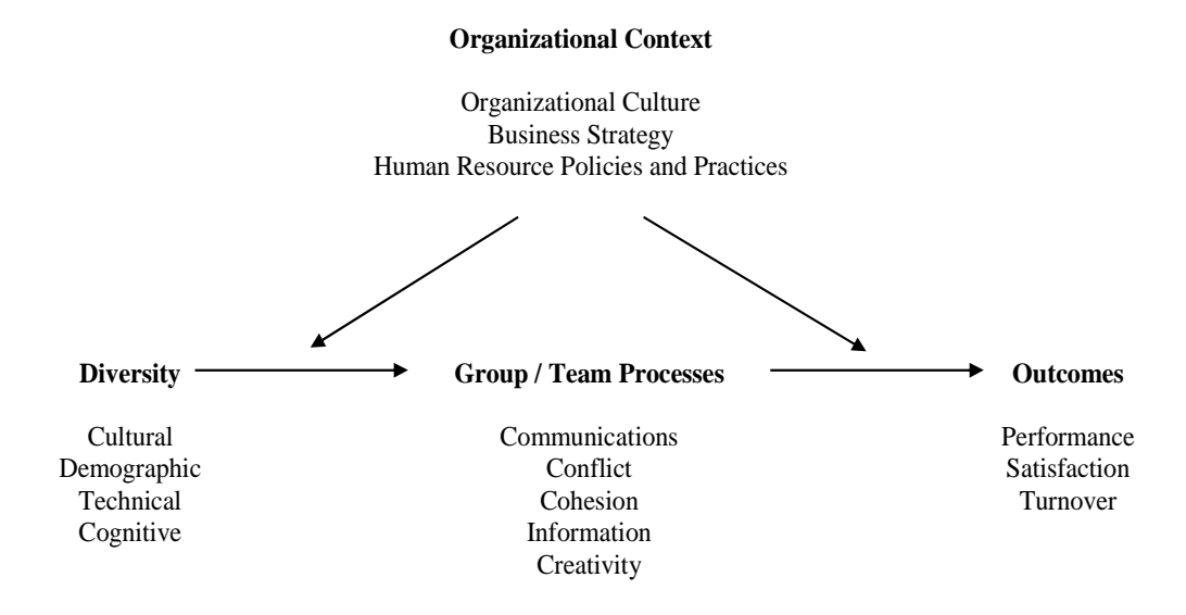
Figure 1: The framework of analysis of the effects of diversity by Kochan et al. (2003)

The two seminal articles cited above (Milliken & Martins, 1996; Kochan et al. 2003) made fundamental contributions to our understanding of the relationship between diversity and performance in organizations. In addition, they, and other authors, have furthered work on types of diversity with the assumption that various kinds of diversity will affect functioning and ultimately performance differently.