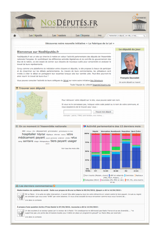
Figure 2. Screenshot, Summary of MP's activity, nosdeputes.fr, 04/15/2015

The heading "Les Citoyens" constitutes the space for the interaction between a MP and members. The "citizen-avatars" are stored in columns, aligned next to each other, giving the impression of a reconstituted collective when the MP is associated to another MP as an item in alphabetical list.