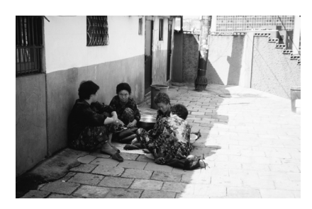
Photo 2. The semi-private use of a dead end in Singondeok-dong's "labyrinth" of alleyways.