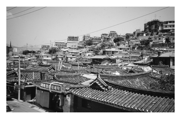
Photo 1. Singongdeok-dong renovation district ( jaegaebal quyeok 再開發區域) in 1996.

Taken in this neighborhood between 1996 and 1999, photos 2, 3, and 4 illustrate the twofold use of the alleyway as semi-private space and local public space. It is a place where women meet up to peel zucchini while exchanging news (photo 2), children ride around on tricycles—a sign that traffic is not a danger (photo 3),