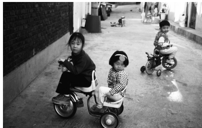
Photo 3. Singongdeok-dong in 1996. The alleyway is a playground for children.