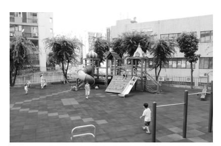
Photo 7. Sadang-dong, a classic scene in a high-rise estate: the children's playground.

ception, social content, image and subsidiary of production, the local public spaces respond to the same considerations in the conception of facilities adapted to the needs of resident populations: either purpose-built open spaces, such as children's playgrounds (photo 7), the most recently built of which sometimes include play fountains (photo 8) or closed common spaces, as in elderly care facilities. To this, one may add the various clubs frequented by women residing in the high-rise estates (clubs for sports, traditional dance, music, etc.). The maintenance of traditional practices may sometimes be observed in these new residential complexes. For example, the use of mats and small platforms placed on the edge of a playground where grandmothers sit down to look after their grandchildren. But these practices, tied to the corporeal postures of a "life lived near the ground" in domestic spaces traditionally lacking tall furniture, tend to die off with the individuals who embody them.