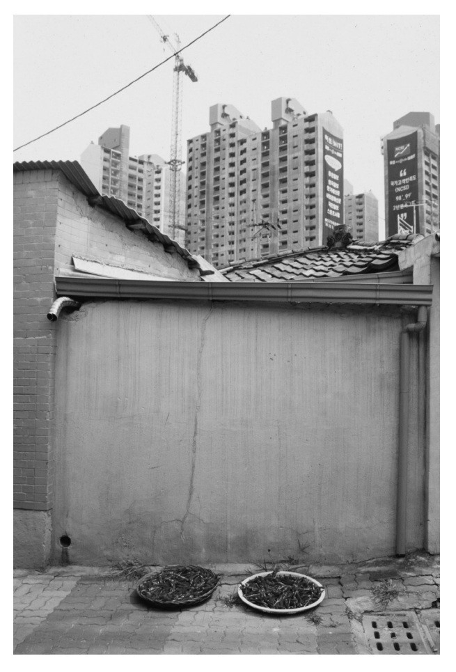
Photo 4. Red peppers dry in an alleyway that appears to be an extension of private space, Singongdeok-dong.

Here, the renovation zone pictured in photo 1 has been rebuilt by a construction branch of the Samsung conglomerate ( jaebeol 財閥).