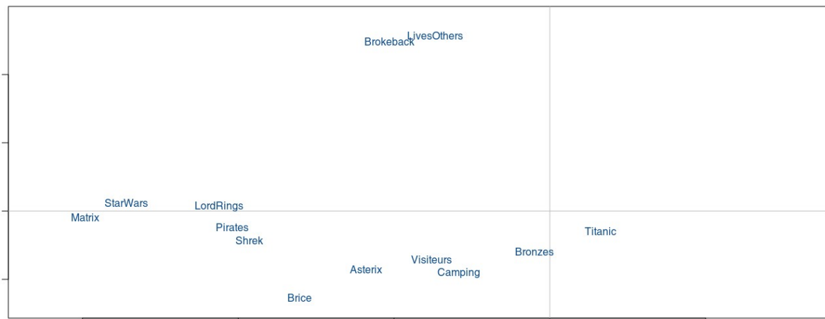
Figure 3 – The movies « especially liked » in the space of tastes for cinema (axes 1-2; « classical » MCA)