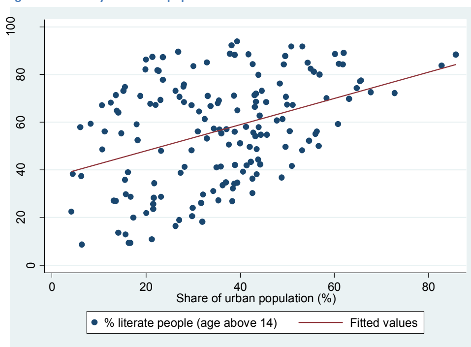
Figure 6.1 Literacy and urban population share