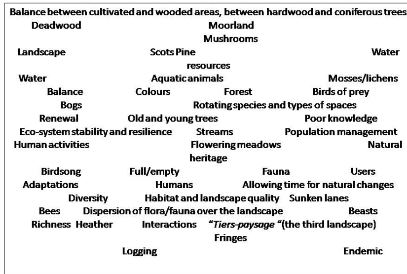
Figure 1. Biodiversity in the stakeholders' own words. The words are indicated at random as expressed by the stakeholders.