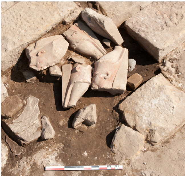
The five royal heads as found, with the priest's head and the stela visible at the right.

masterpieces of New Kingdom private art. After a few days of work cleaning them, they were taken to the MSA storeroom in Moalla. Study of the texts covering the base and the back-pillar of the two statues will certainly provide new data about these two high-ranking officials, their role in the Theban area and their relationship with the god Montu of Armant.