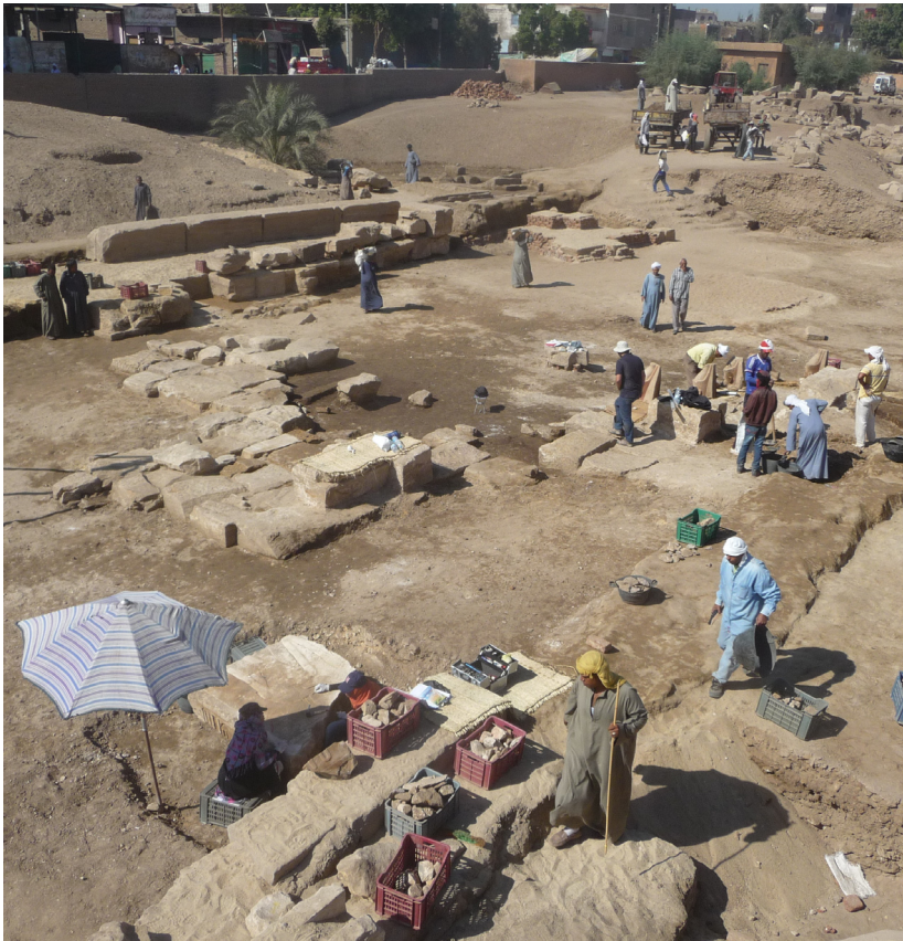
General view of the excavated area.

In November 2013 the cleaning of the destruction layers of the Montu Temple continued with work especially focused on the area of the pronaos . Its south-west part had been extensively looted and it is thus much less well preserved than its opposite part. But an important area of the pronaos foundation was uncovered, revealing, as expected, some reused sandstone blocks of the New