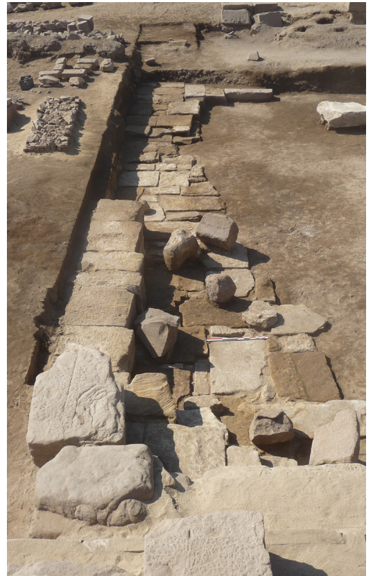
Façade of the west part of the pronaos.