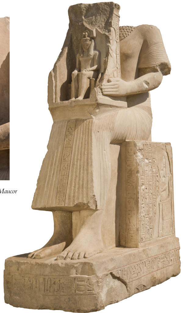
The statue of Nebamun.

A few metres away from the statue of Nebamun, a headless granodiorite statue (68.5cm high) of the ‘High-Priest of Montu from Armant’ Ramose was unearthed. Over a pleated kilt covering his legs, he wears a panther skin adorned with stars and the head of the panther appears on the right side of his torso. Ramose is shown kneeling and holding an altar upon which two falcon heads are carved in the round. Each falcon-head was probably topped by a sun-disk and two feathers, but these are lost. These two manifestations of the local god Montu are quite unexpected and seem to have no parallels in that aspect, although some Late Period bronze statuettes of deities with two falcon heads are known. There is also the double prow aegis of the Montu barque which is attested in quite rare documents. These two very original statues are beautifully carved and can be considered as