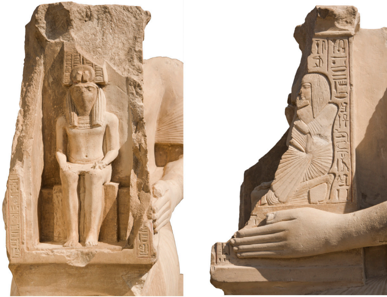
The naos held by Nebamun, and its left side.

Kingdom. The foundation courses of the pronaos façade were also almost entirely unearthed.