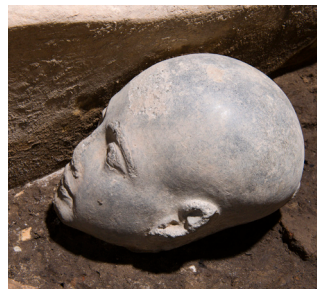
The priest's head which was found to join the Ramose statue.

On the central axis of the pronaos , close to its sandstone foundation blocks, a large (158cm x 131cm) limestone slab dating to the reign of Amenemhat I and carved with a relief figure of Anubis (or a Soul of Nekhen) holding the hand of the king was found. Inside a recess formed by few of these foundation blocks, five royal heads (each c.70cm high) were unearthed. Four of them wear the Double Crown while the fifth one, found upside down, has the White Crown. The disposition of the five heads in the ground clearly shows that they were intentionally grouped together in quite a small area. In between the heads three rounded upper parts of White Crowns were also found. One of these had been deposited close to the head to which it belongs. Each of the royal heads had been painted in red (for the skin and Red Crown) and blue