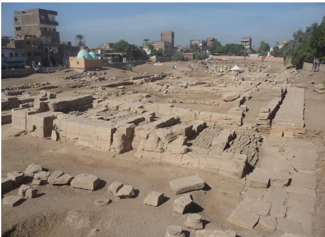
General view of the temple of Montu-Re at Armant.

The current fieldwork which is a joint mission of IFAO, the CNRS (USR 3172-CFEETK) and the University of Montpellier 3 intends to complete the excavation and cleaning of the foundation platform of the temple which is still partially covered with debris. The main aims are to determine the plan of the temple and to survey and study all the loose and reused blocks found in the field. Since 2004 a huge effort has been made to remove the debris which covers the south-west part of the temple, this area having been used by Mond and Myers as the