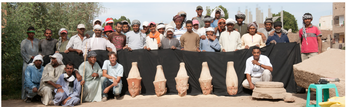
The team and the five royal heads.