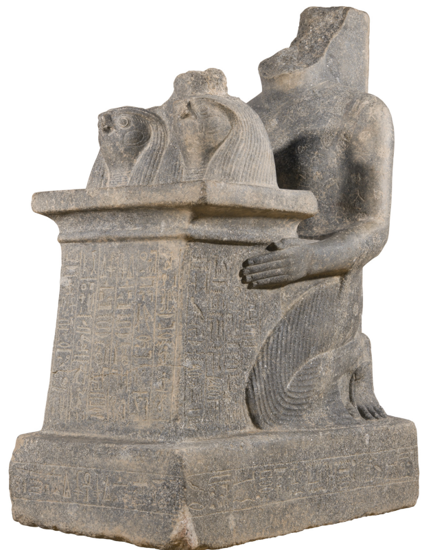
The statue of Ramose.