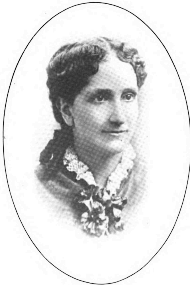
MRS. MARY BAKER EDDY

From a photograph taken while living in Lynn