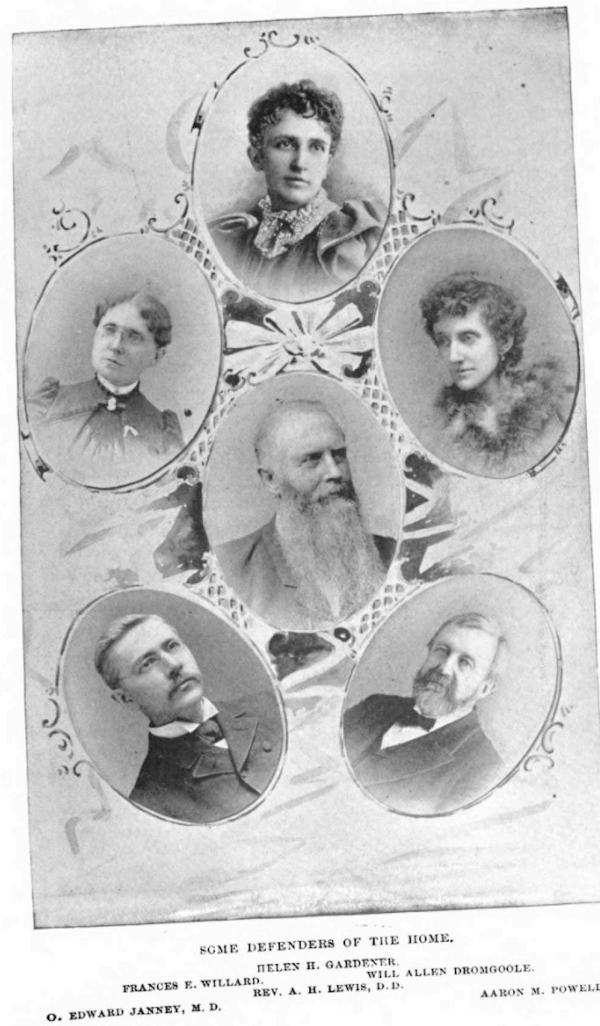
Figure 8. "Some defenders of the home"

flood their representatives with letters. 45 For all his talk about a radical and broad purification of society, a single-issue campaign finally did prove more effective - by the end of 1895, the age of consent was raised in six states. 46