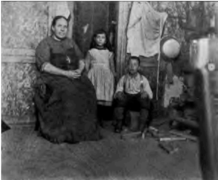
Figure 6. An example of "typical" poverty of the time: "widow and two children in under-ground tenement"

Like Jacob Riis in New York, Flower studied poverty in Boston and used the power of photography to document the life of the underprivileged in a book entitled Civilization's Inferno, or, Studies in the Social Cellar . 33 His study - part sociological survey based on fieldwork and statistical analysis, part mise en scène of poverty and a modern rewriting of Dante's circles of hell to shock readers into action - revealed the gendered nature of urban poverty at the time. His description of the case of a widow and two children working in an underground tenement was, for him, "typical" of problems at the time (cf. figure 6). 34 Flower, like many middle-class reformers, was shocked by the discovery of women's poverty and the dangers it posed to their purity. For Flower, the written word failed to describe the "social cellar" - only "a few glimpses of the horrors of the abyss" could be caught. 35 The word "abyss" and the darkness metaphor evoke all the unspeakable dark mysteries of the industrial city and the seemingly bottomless immorality it produced, the metaphor encapsulating in one vague, ominous term the various moral, religious, physical, racial, gender and imperial aspects of a complex phenomenon: the inexplicable squalor in a country of abundance, female degradation, male immorality, crime, and the explicit analogy between investigators' "studies in the social cellar," and the exploration, in the wake of Stanley, of the "Dark Continent" and its savagery. 36