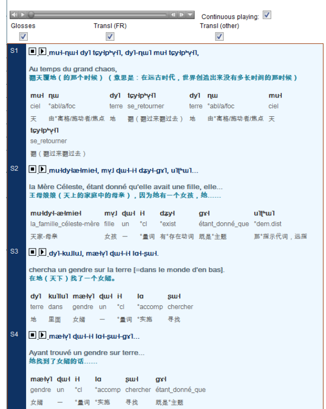
Fig. 3: HTML resulting from application of the XSL stylesheet

The Archive Project browsing and interrogation systems are entirely distinct from the authoring tools. Linguistic documents prepared by the project are browsed and queried using standard browsers through a standard web interface, facilitating their dissemination. The browsing system is relatively stable, but the data management and querying software is in an early stage of development, in part because of a lack of defined standards and hence of standard tools. General searching, word-indexing, and concordancing modules have been developed in prototype form.