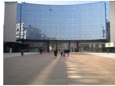
The minerality of the Europole district