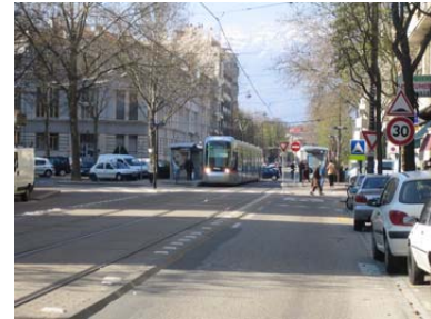
The landscaped setting of the Ile Verte neighbourhood

However the walkability of these districts should not only be judged by their landscaped or commercial attractiveness. On the contrary, walking is the result of a complex combination of conditions determined by practical possibilities, the pedestrian's own wishes and the ability of the environment to stimulate perception.