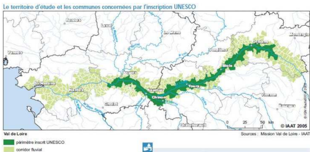
Illustration n. 2 – The UNESCO perimeter (in dark green), and the river corridor (in light green)

To resume: concretized by the UNESCO inscription of 2000, within a certain global heritage “fever”, it aims to valorise local heritages as a resource for economic and territorial development. Promoting a reorganization of the system of action and actors it allows to observe eventual territorial recompositions (on a non ordinary territorial cut-out base) and to observe ten years impacts.