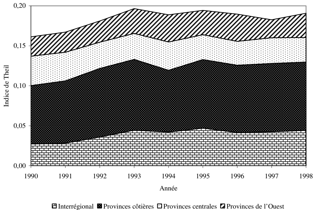
Figure 1 - Decomposition of the Theil Index : Real GDP per capita