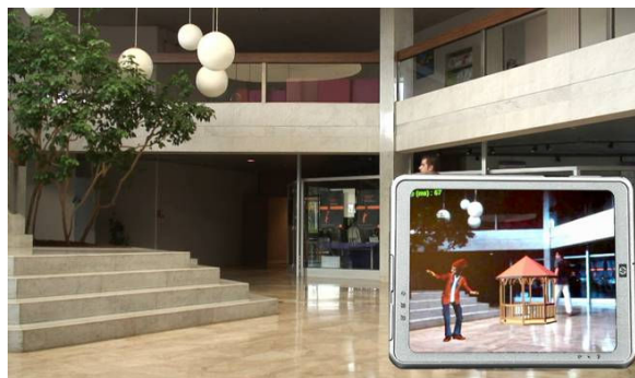
Figure 2: Augmenting the real world with digital overlays

And though the above mentioned issues might constitute only a part of the challenges present in the domain of mobile multimedia guides used in the museum setting, they lie in the core of a successful integration of mobile guides in the museum setting and they are by no way trivial.