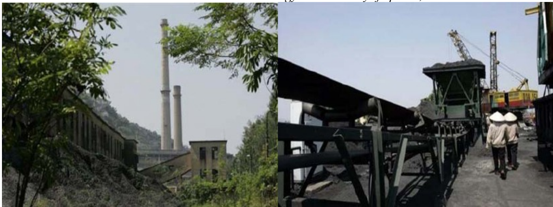
Figure 1: The Ninh Binh conventional coal-fired power plant was constructed over 20 years ago and continues to use outdated technology.

To meet the increasing demand for electricity services expected in 2010–2030, Vietnam can rely largely on domestic coal reserves, which were estimated at 3.8 million tons as of January 2002 and are 85% anthracite coal (heat value ranges between 5200 kcal/kg and 5700 kcal/kg). Over the period of 2002–2020, the qualified coal yield is expected to increase from 13.8 million tons to 30 million tons per year, and it could reach 40 million tons per year in 2030. To exploit this resource, an intense generation capacity expansion plan based on coal-fired generation is already underway (Institute of Energy, 2006, 2007). So far, all coal-fired generating plants that have already been committed to and those planned in the years leading up to 2015 are based on conventional pulverized and circulating fluidized bed technologies. Advanced and cleaner coal-fired technologies such as IGCC and PFBC are not yet included in the long-term generation capacity expansion development master plan. If barriers to the adoption of these technologies can be overcome, overall efficiency will be significantly increased.