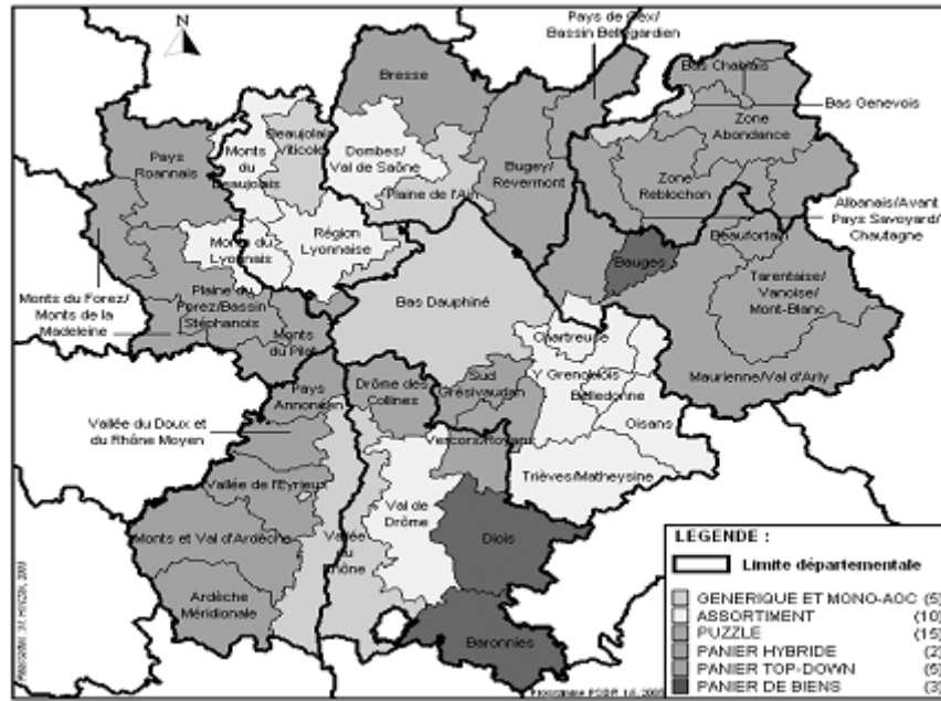
FIGURE 2 Typology of territorialized complex goods in the Rhône-Alpes région